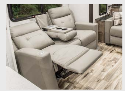
Theater seating w/heat, massage & USB ports (VBF).