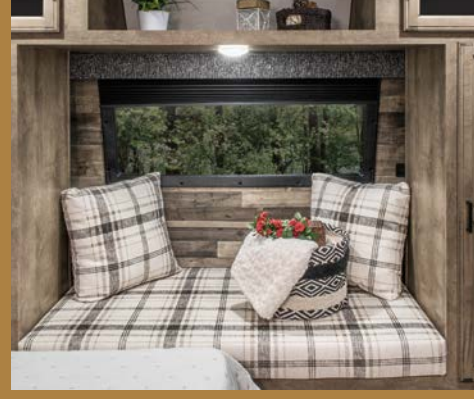
Most models feature a cozy window seat in the master bedroom, with additional storage under the bench to maximize the space. (STT343VIK shown)

Living spaces are a dream, with 30-inch fireplaces in the living room and master bedroom. TVs are either 40-inch or 50-inch, depending on floorplan (STT333VMI shown with 50" TV).