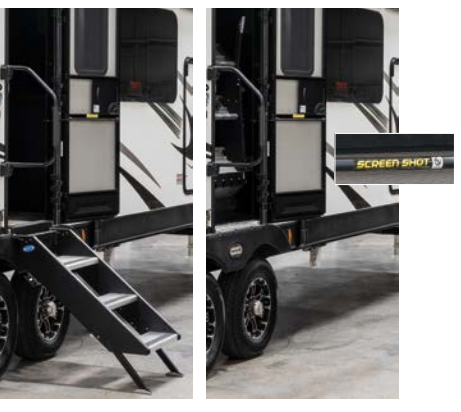
All SportTrek Tourings feature a solid flip-up step and friction-hinged entry door with Screen Shot screen door.

Painted full fiberglass front cap w/panoramic automotive front window