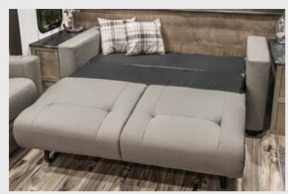
Tri-fold sofa is easy to convert and comfortable, whether used as a sofa or a bed (VBF).