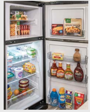
10 CU FT double-door refrigerator with antique white cabinet front.

UVW - 8,970 lbs. | Exterior Length - 37' 5" | Sleeps - 4