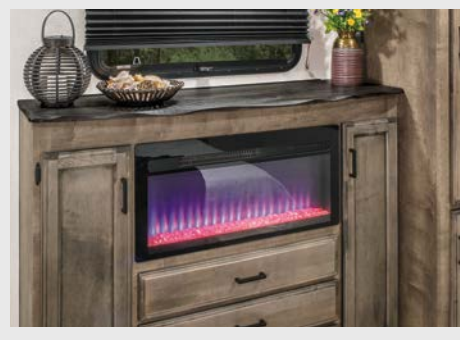
Cozy X2 - standard 30-inch bedroom fireplace produces 5,000 BTUs of electric heat, plus an additional standard 30-inch living room fireplace provides ambience throughout the trailer.