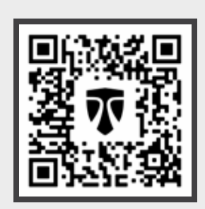
Use your phone's camera to find out more information. Just scan the code!