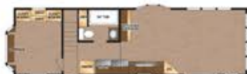
8031 11' x 38'