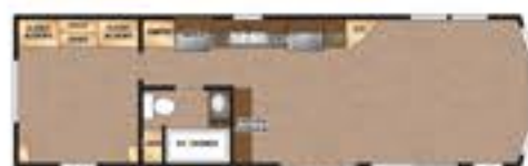
8044K 11' x 38'