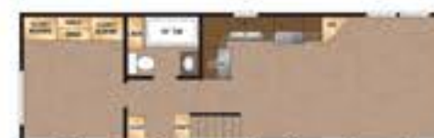
8113 11' x 38'