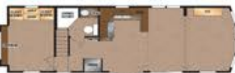
8029 11' x 38'