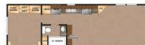
8044KLE 11' x 38'