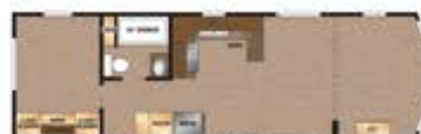
8005LE 11' x 38'