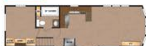
8006BA 11' x 38'