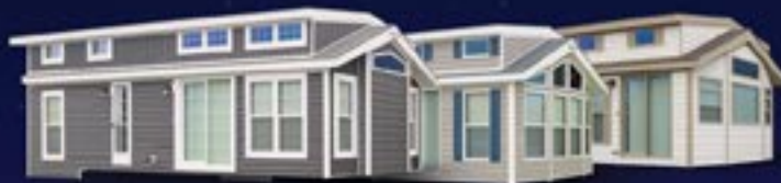
ISLAND LAKESIDE LAKESIDE LE