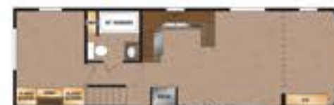
8006BLE 11' x 38'