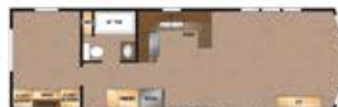
8005BLE 11' x 38'