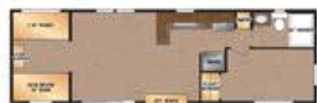
6038B 11.5' x 37'