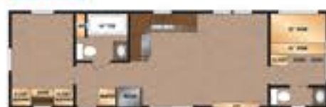
8115B 11' x 37'