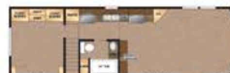
8043KLE 11' x 38'