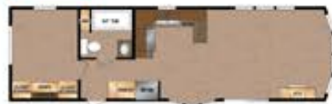
8005B 11' x 38'