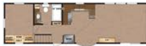
8101 11' x 38'