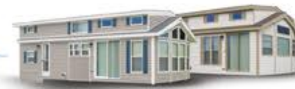
LAKE SIDE LAKE SIDE LE