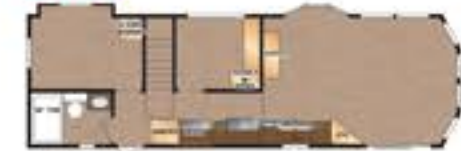
8033 12' x 36'