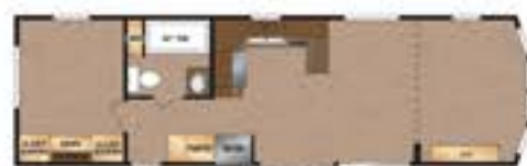
8005 11' x 38'