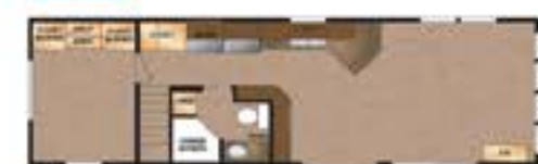
8042 11' x 38'