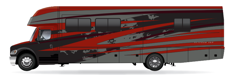
G1 FIRE OPAL