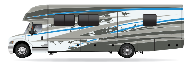
G1 GLACIER BLUE