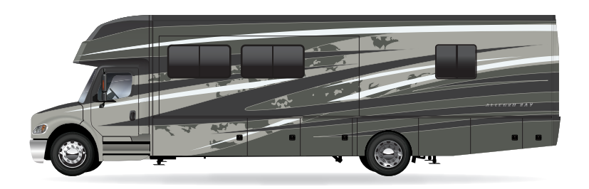
G1 FROSTED GRANITE