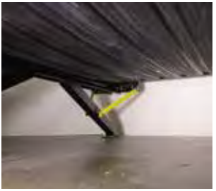
Electric Stabilizer Jacks W/Footpad - Make setup & teardown sweat free, keeping your trailer stabilized while parked. - N/A 1475 & 1575