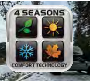
Four Season's Comfort Technology Package - Key features including a heated holding tank design, insulated hatch covers & insulated over-cab bed mat, keep you warmer in the winter and cooler in the summer!