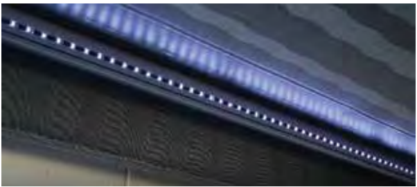
Latitude Powered Awning - Provides unobstructed shade with direct response wind sensor & LED light bar.

What other manufacturers call optional, along with Lance quality, our customers enjoy 20+ of the most requested features as standard equipment. Below is a sampling of the more popular options, please see pages 16 & 17 for a complete listing.