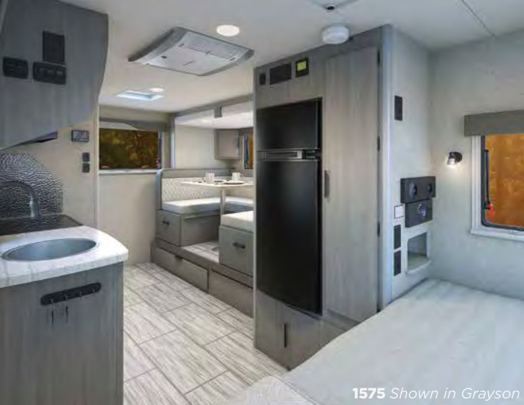
1575 Shown in Grayson