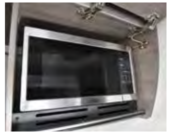
Flat Bottom Microwave - Offers the latest cooking technology.