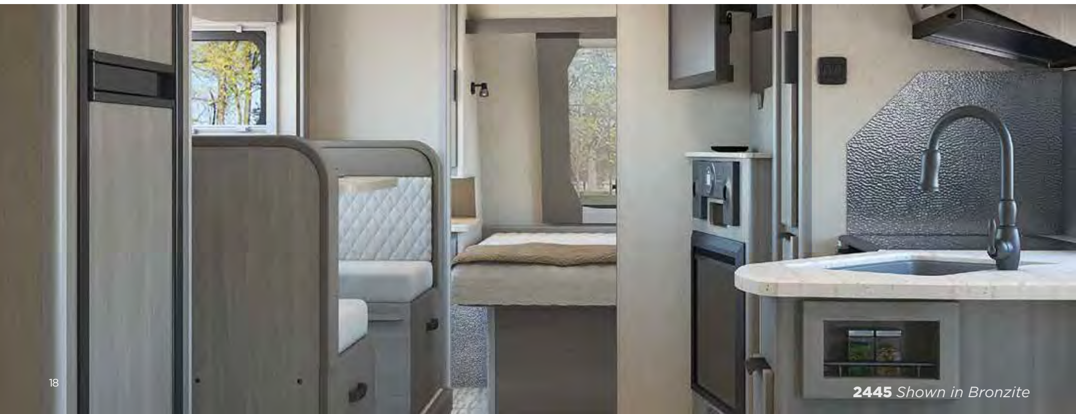
2445 Shown in Bronzite