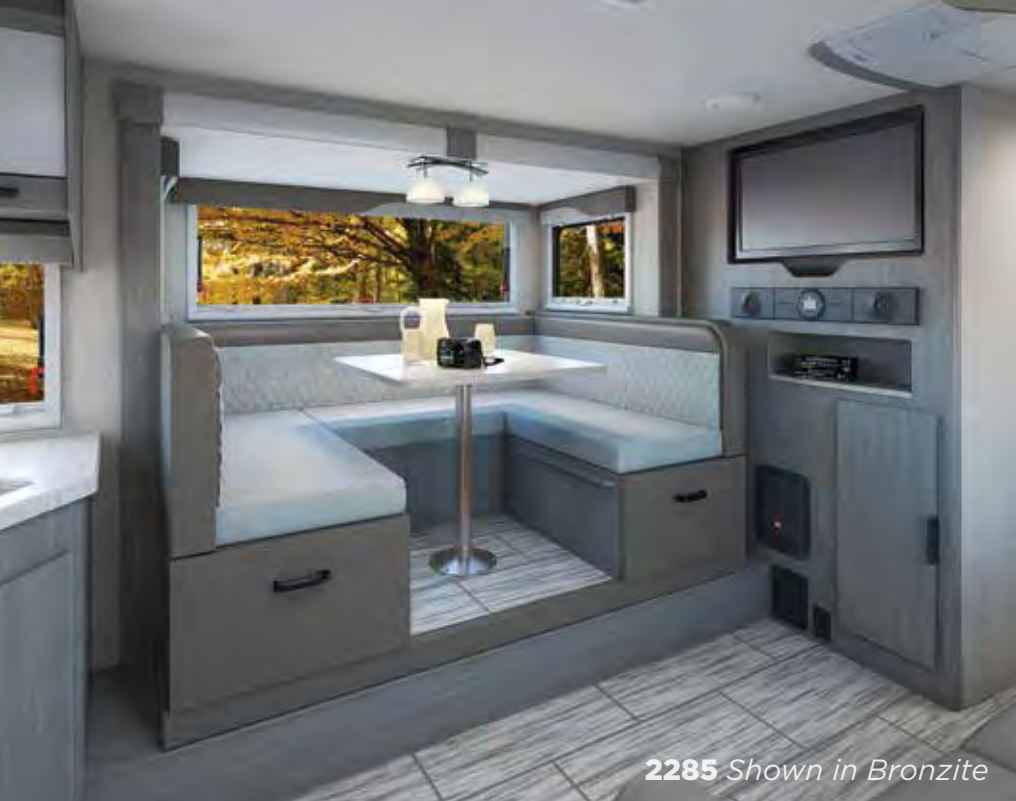
2285 Shown in Bronzite