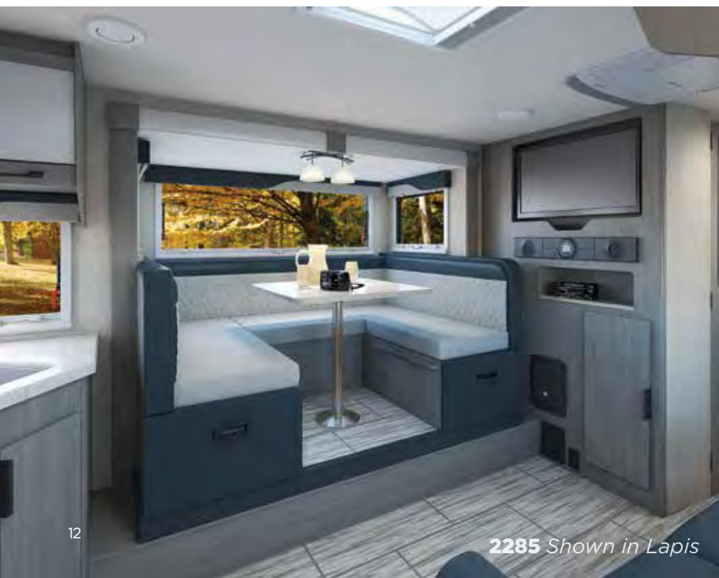
2285 Shown in Lapis