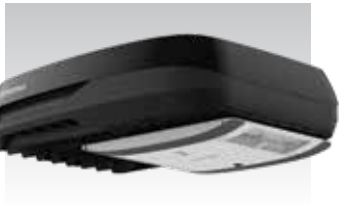
Truma A/C - One of the quietest A/C systems available is now standard equipment on Lance Trailers! Expanding on our partnership with Truma, the Aventa A/C brings efficiency and comfortable TV watching and night mode decibel levels!