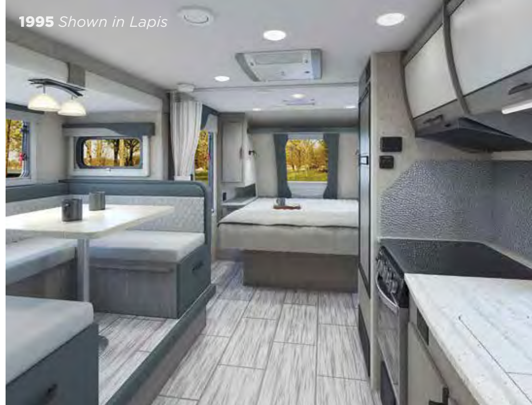
1995 Shown in Lapis