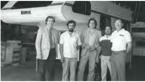
Established 1965 - From humble beginnings in North Hollywood, CA, to our current 13-acre campus home in Lancaster, CA, and recent expansion in Decatur, Lance has kept quality, product innovation and customer care as its primary objectives.