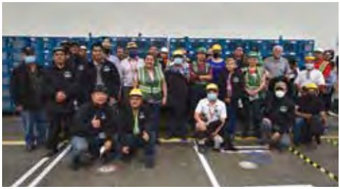
Experienced Staff - From our sales and service staff with a combined 1,000+ years of RV experience assisting customers and dealers to the 400+ production staff with 20+ years of tenure, the Lance Team has the expertise and passion for delivering the highest possible quality product, sales, and service experience in the industry.