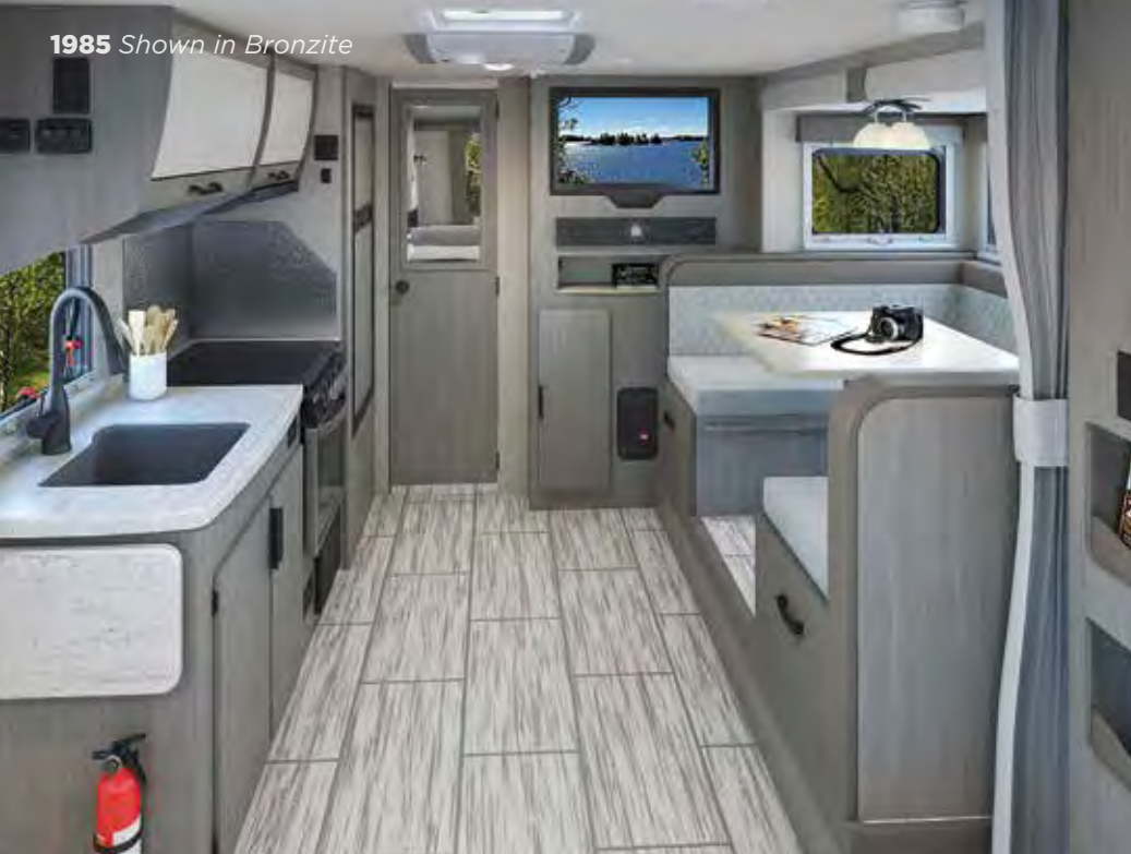
1985 Shown in Bronzite