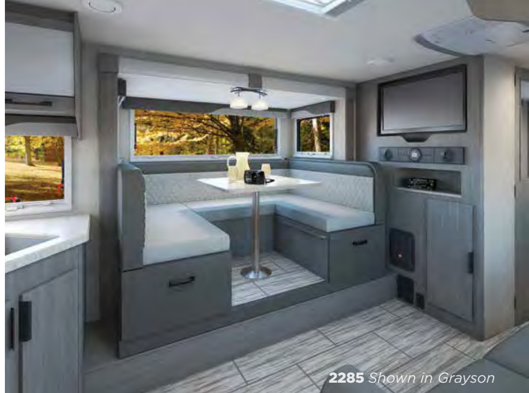
2285 Shown in Grayson