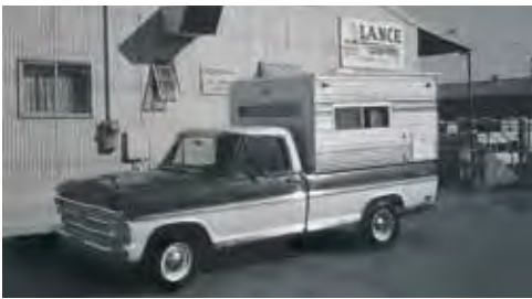
California Roots - From humble beginnings in North Hollywood, CA, in 1965 to our current home in Lancaster, CA, as a result of a fierce dedication towards building the highest quality RVs possible, understanding our customer's needs and insulated from the "me too" designs of our competitors, the Lance brand has become one of the most respected and sought-after brands in the industry.

Over 50 years of quality and industry-leading innovations have positioned the Lance brand as one of the most sought-after RVs on the road today. Respect is earned and not easily obtained in today's competitive marketplace.