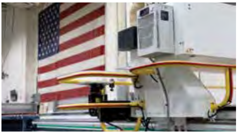
3D advanced CAD engineering create precise plans that run CNC machinery. The result is that every part is the same and perfect every time.