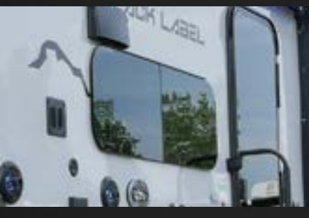
Automotive Frameless Windows Package

Gel Coated Fiberglass, Power Tongue Jack, Aluminum Rims