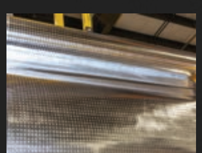
Thermo-Foil Arctic Insulation