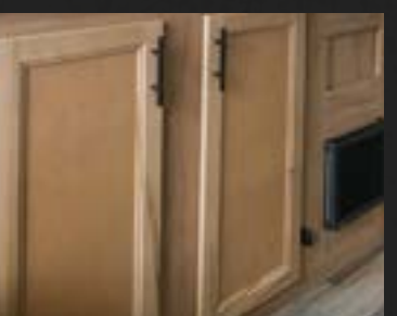
Solid Wood Cabinet Doors