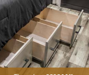
Three deep BEDROOM DRAWERS under the bed, for added storage.