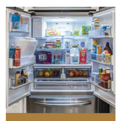
OPTIONAL 23 CU FT RESIDENTIAL REFRIGERATOR

with temperature controls and easy slide out freezer drawer below.