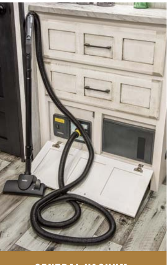
CENTRAL VACUUM with multiple attachments, stores out of sight.

Heated, insulated & enclosed underbelly plus foil in floor, roof, front, rear! R-13* sidewalls, R-38* roof and floor. *Calculated R-Value