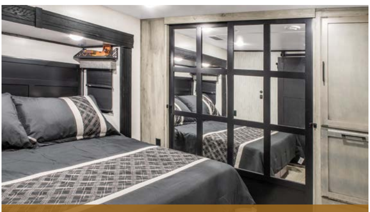
Enjoy a good night's sleep with an ELECTRIC TILT BED WITH SERTA COMFORT FOAM KING MATTRESS with under-bed storage.