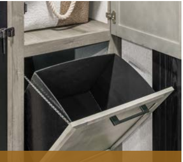
Bedroom cabinetry with BUILT-IN HAMPER