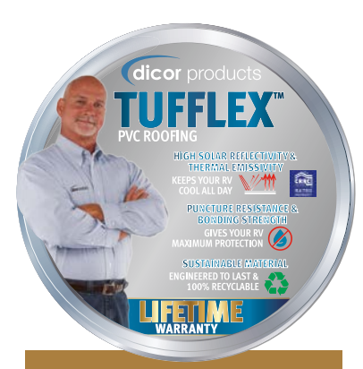
TUFFLEX PVC ROOFING with lifetime warranty and 3/8" walkable roof.

OPTIONAL "OFF THE GRID" SOLAR PACKAGE includes (2) 220W solar panels, 30A MPPT solar charge controller w/ MPPT remote panel, 2,000W True Sine Wave Inverter w/all outlets "hot".