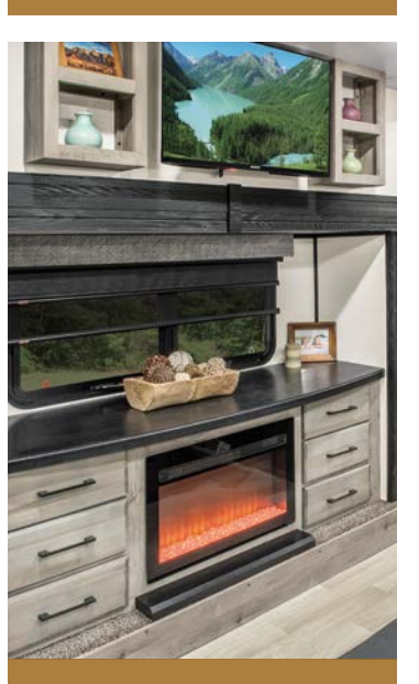
BUILT-IN DRESSER offers plenty of storage, and top lifts up and offers HIDDEN STORAGE for valuables. (select models)