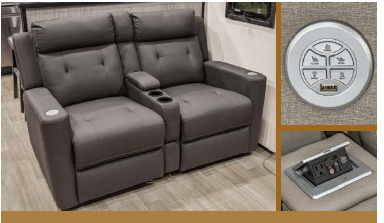
THEATER SEATING with cupholders, USB plug, heat, massage, and power recline/decline.