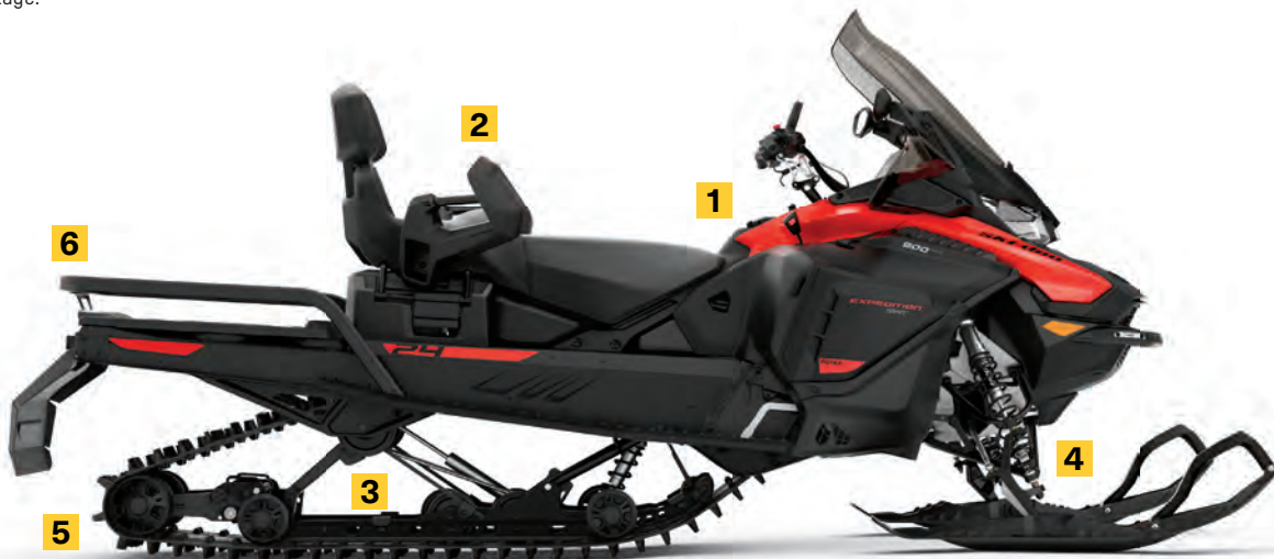
EXPEDITION® SWT 900 ACE™ TURBO SHOWN

The articulated rail maximizes deep-snow traction in reverse, and its toolless locking mechanism is ideal for towing.