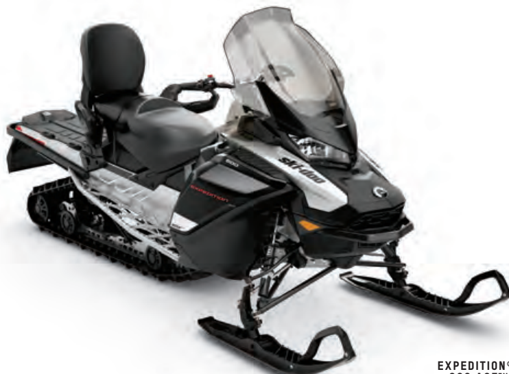
EXPEDITION® SPORT 900 ACE™ SHOWN

Ultra-responsive chassis for on- or off-trail rides and extensive array of sport-utility and 2-up features.