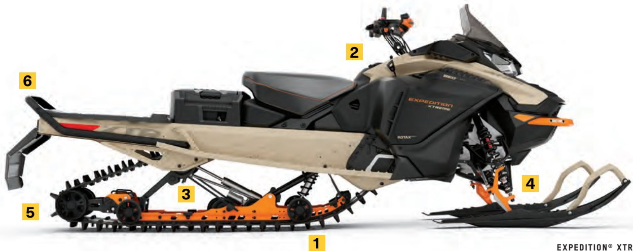
EXPEDITION® XTREME™ 850 E-TEC® SHOWN

Extreme-capability, extreme-durability shocks with compression adjustment for optimized control in the toughest conditions. Lightweight aluminum and rebuildable/revalvable.