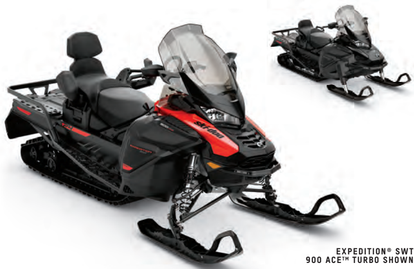
EXPEDITION® SWT 900 ACE™ TURBO SHOWN

A supreme deep-snow sport-utility vehicle with unrivaled flotation and an exemplary list of utility features.