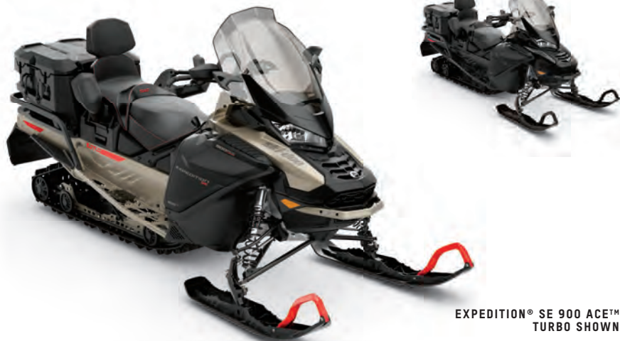
EXPEDITION® SE 900 ACE™ TURBO SHOWN

The utmost touring sport-utility vehicle with an incredible list of work and luxury features.