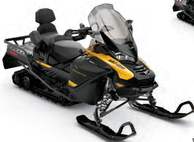
EXPEDITION® LE 900 ACE™ TURBO SHOWN

A hybrid touring sport-utility vehicle with premium features for off-trail exploration and on-trail cruises.