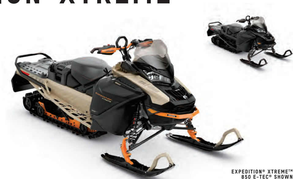
EXPEDITION® XTREME™ 850 E-TEC® SHOWN

The high-performance sport-utility sled with capability to go just about anywhere.