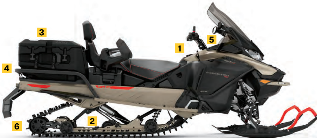
EXPEDITION® SE 900 ACE™ TURBO SHOWN

135 L/35.7 gal of lockable, weather-resistant storage capacity. Incorporated hatchet and saw holder, plus attachment points for bungees and two 16 in. LinQ positions on top for expandable accessory use.