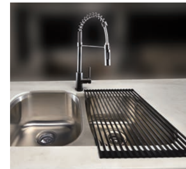
Clean up is quick and easy with stainless steel undermount sinks and this single handle, pull-out faucet with sprayer.