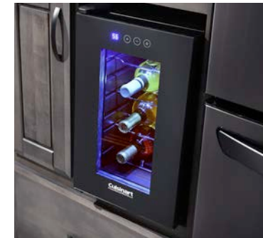
The Cuisinart® Private Reserve® Wine Cellar quietly and efficiently maintains the ideal storage temperature, (between 39° to 68°F), to preserve the quality of your favorite wines. This thermoelectric cooling system is touchpad controlled, has a stainless finish and soft interior lighting.