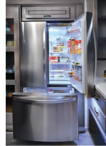
20 Cu. ft. residential stainless steel electric refrigerator with ice maker and dedicated inverter.