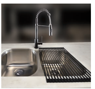
Clean up is quick and easy with stainless steel undermount sinks and this single handle, pull-out faucet with sprayer.