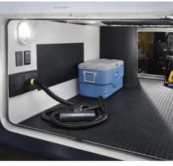
This heated front storage compartment provides over 100 cu. ft. of storage, and includes an extra vacuum port for outside clean-ups.