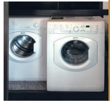
Optional side-by-side washer and dryer.