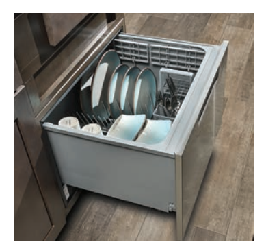
A stainless steel dishwasher is optional on select models.