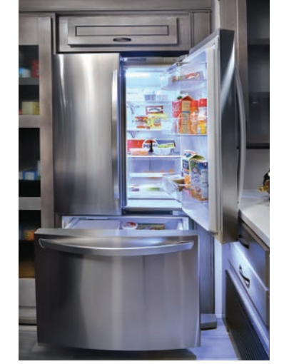
20 Cu. ft. residential stainless steel electric refrigerator with ice maker and dedicated inverter.