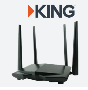
The standard KING WiFiMAX router/range extender can be configured to connect to available networks and devices with password access.