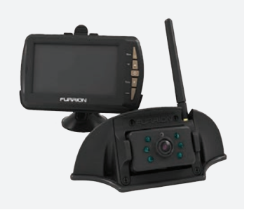
Champagne fifth wheels are prewired for an optional Furrion rear camera or four camera security system.