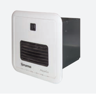
Truma<sup>™</sup> AquaGo Instant Water Heater – A constant, endless supply of hot water, for showering, rinsing, and hand washing. A 12 Gallon Gas/Electric water heater is optional.