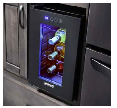
The Cuisinart<sup>®</sup> Private Reserve<sup>®</sup> Wine Cellar quietly and efficiently maintains the ideal storage temperature, (between 39° to 68°F), to preserve the quality of your favorite wines. This thermoelectric cooling system is touchpad controlled, has a stainless finish and soft interior lighting.