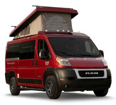
Deep Cherry Red Crystal Pearl