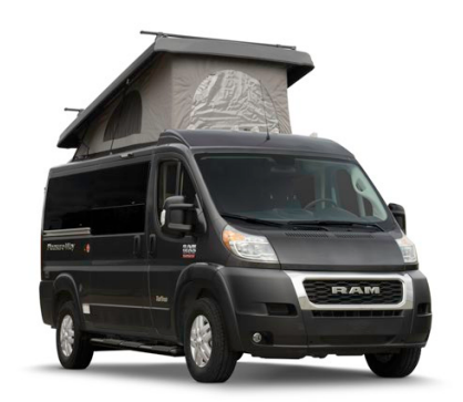
Granite Crystal Metallic