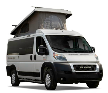
Bright Silver Metallic