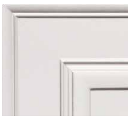
FOSSIL (PAINTED CABINETRY)