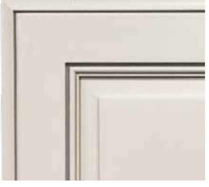
SUMMIT ASH (PAINTED W/GLAZED ACCENTS CABINETRY)