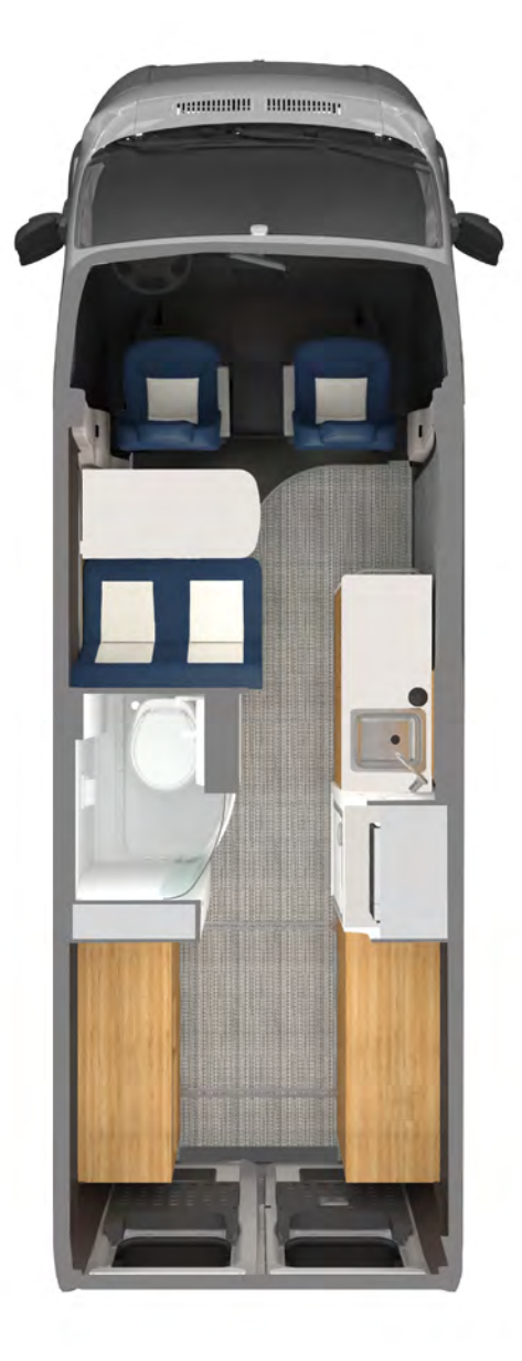
Bed System Up