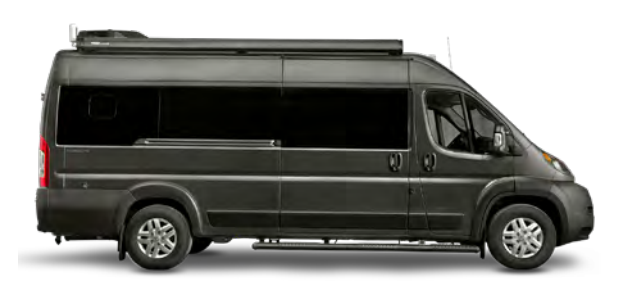
Granite Crystal Metallic