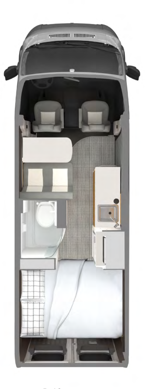
Bed System Down