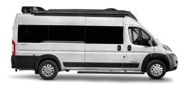
Bright Silver Metallic *Model shown with optional pop-top