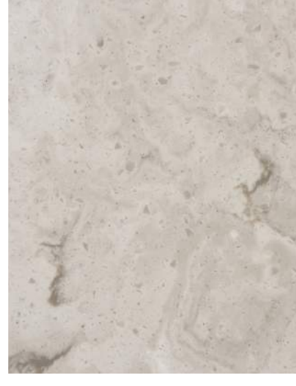
Aurora Ash Countertops