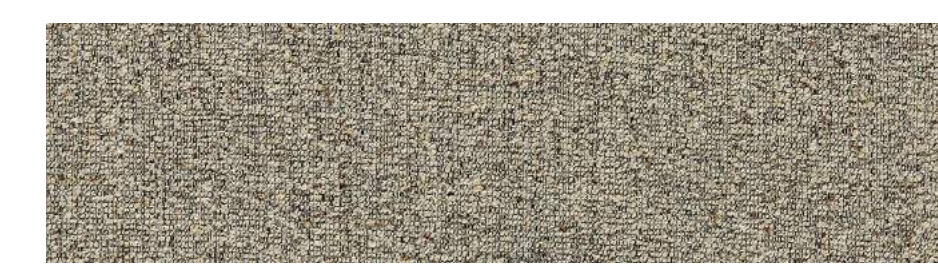
Invoke Dinette Chairs