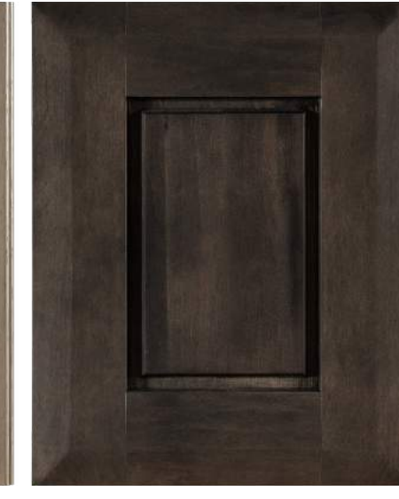
Columbian Maple Cabinets Irish Cream Cabinets