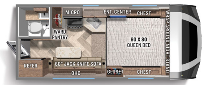
3/4 TON TRUCK W/ 6' 6" UP TO 8' BED