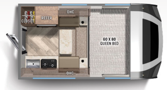
1/2 TON TRUCK W/5' UP TO 8' BED