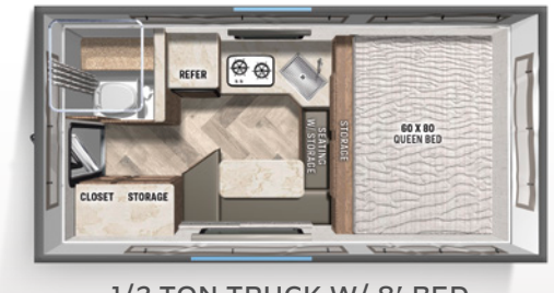
1/2 TON TRUCK W/8' BED