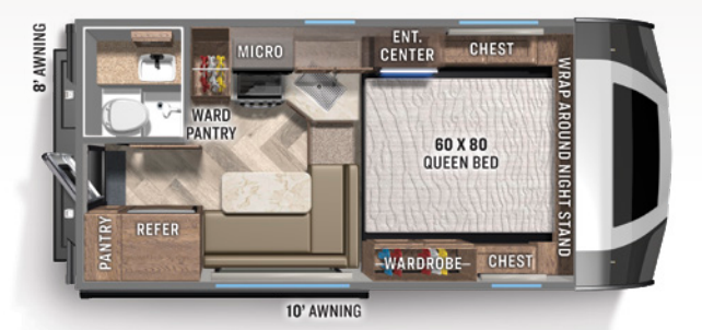
3/4 TON TRUCK W/ 6'6" UP TO 8' BED