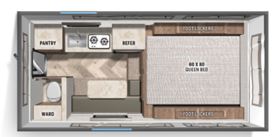
1/2 TON TRUCK W/ 6'6" UP TO 8' BED