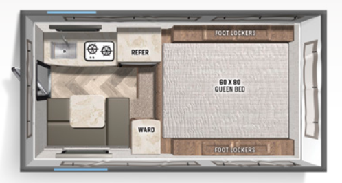
1/2 TON TRUCK W/5'6" UP TO 8' BED