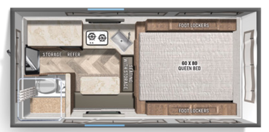
1/2 TON TRUCK 6'6" BED W/OVERHANG