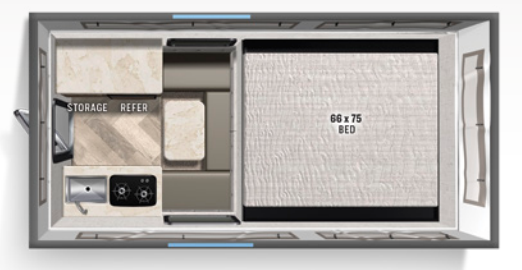
DESIGNED FOR COMPACT TRUCKS