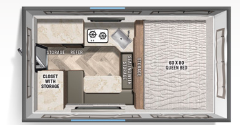
1/2 TON TRUCK W/ 6'6" UP TO 8' BED