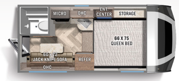
1/2 TON TRUCK W/ 5'6" UP TO 8' BED