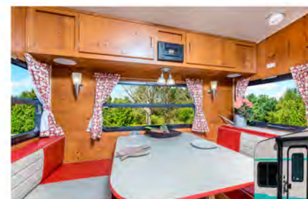
Above: 19ERD Dinette with Crimson and Cream interior, Woodie option