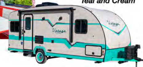
Below: 19ERD in Teal and Cream