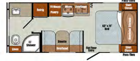
19RBS L: 23'1", Wgt: 3,119 lbs.