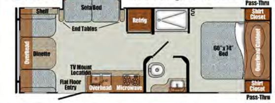
23RSS L: 26'1", Wgt: 3,920 lbs.