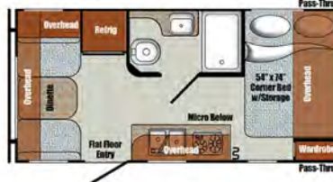
17RWD L: 20'0", Wgt: 2,567 lbs.