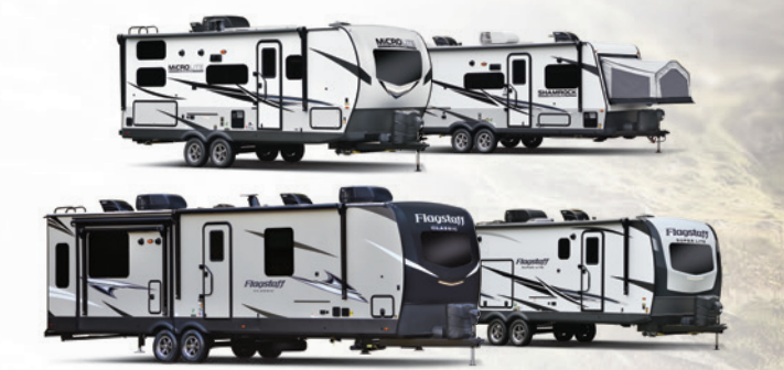
FLAGSTAFF TRAVEL TRAILERS