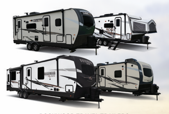
ROCKWOOD TRAVEL TRAILERS