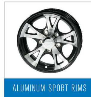
ALUMINUM SPORT RIMS