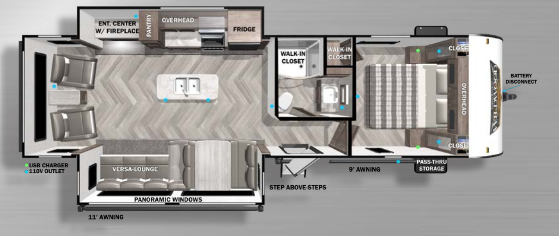
MODEL #: 27RE UVW: 7,583 LBS LENGTH: 33'8"