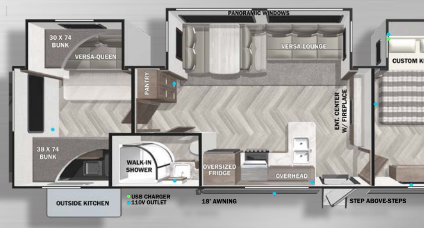
MODEL #: 33TS UVW: 9,276 LBS LENGTH