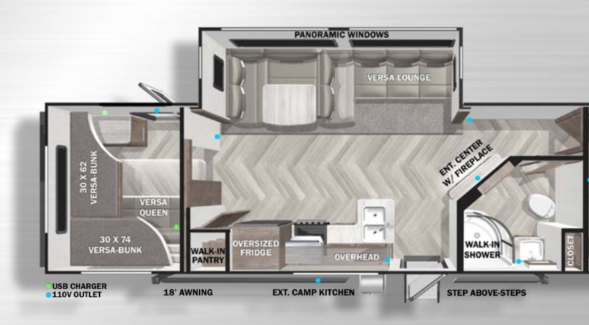
MODEL #: 29VBUD UVW: 7,728 LBS LENGT