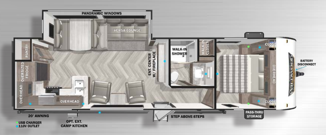
MODEL #: 27RK UVW: 6,863 LBS LENGTH: 33'6"