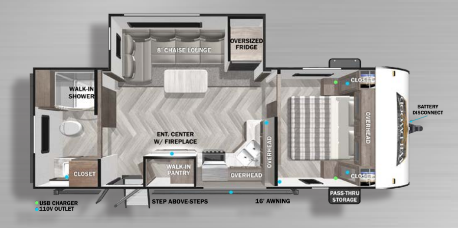
MODEL #: 22RBS UVW: 5,928 LBS LENGTH: 26'11"