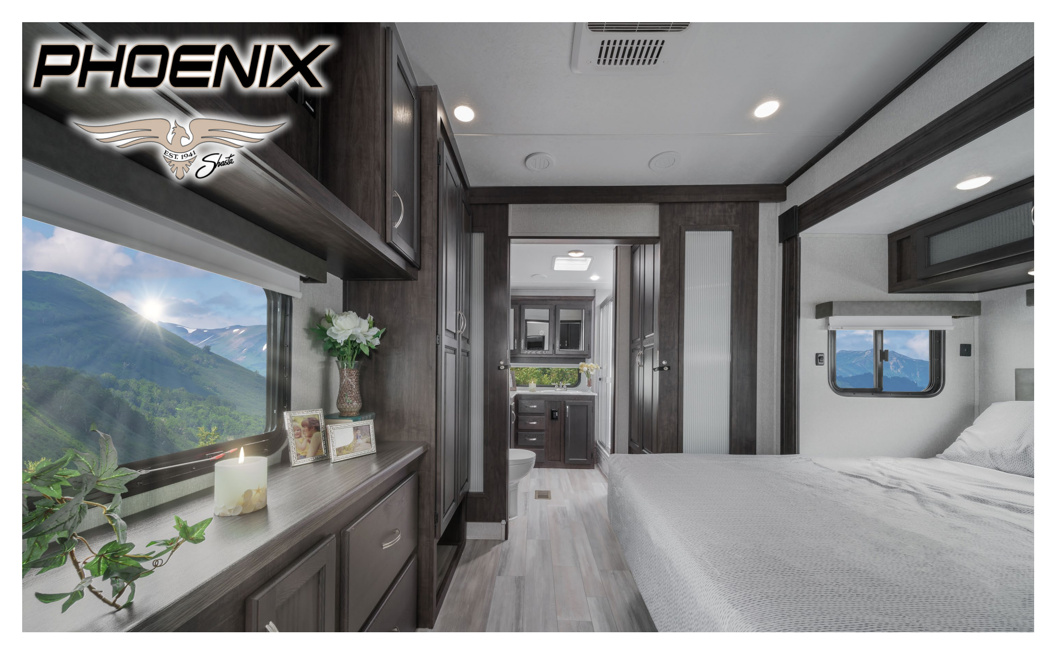
Master Suite & Dual Lav Master Bath - 334FL (Front to Back)