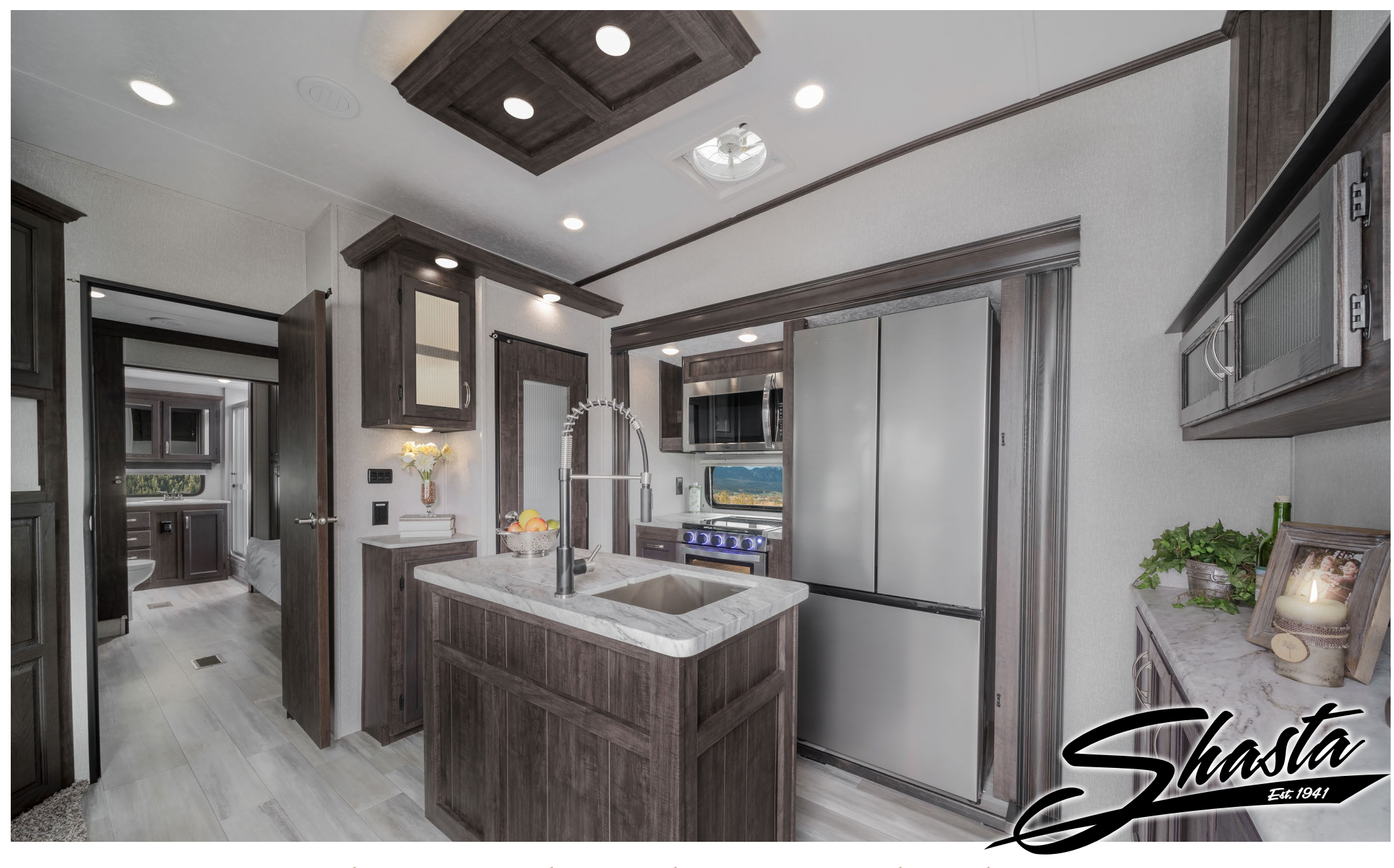
Dream Kitchen w/ Stainless Appliances & Residential Pantry - 334FL