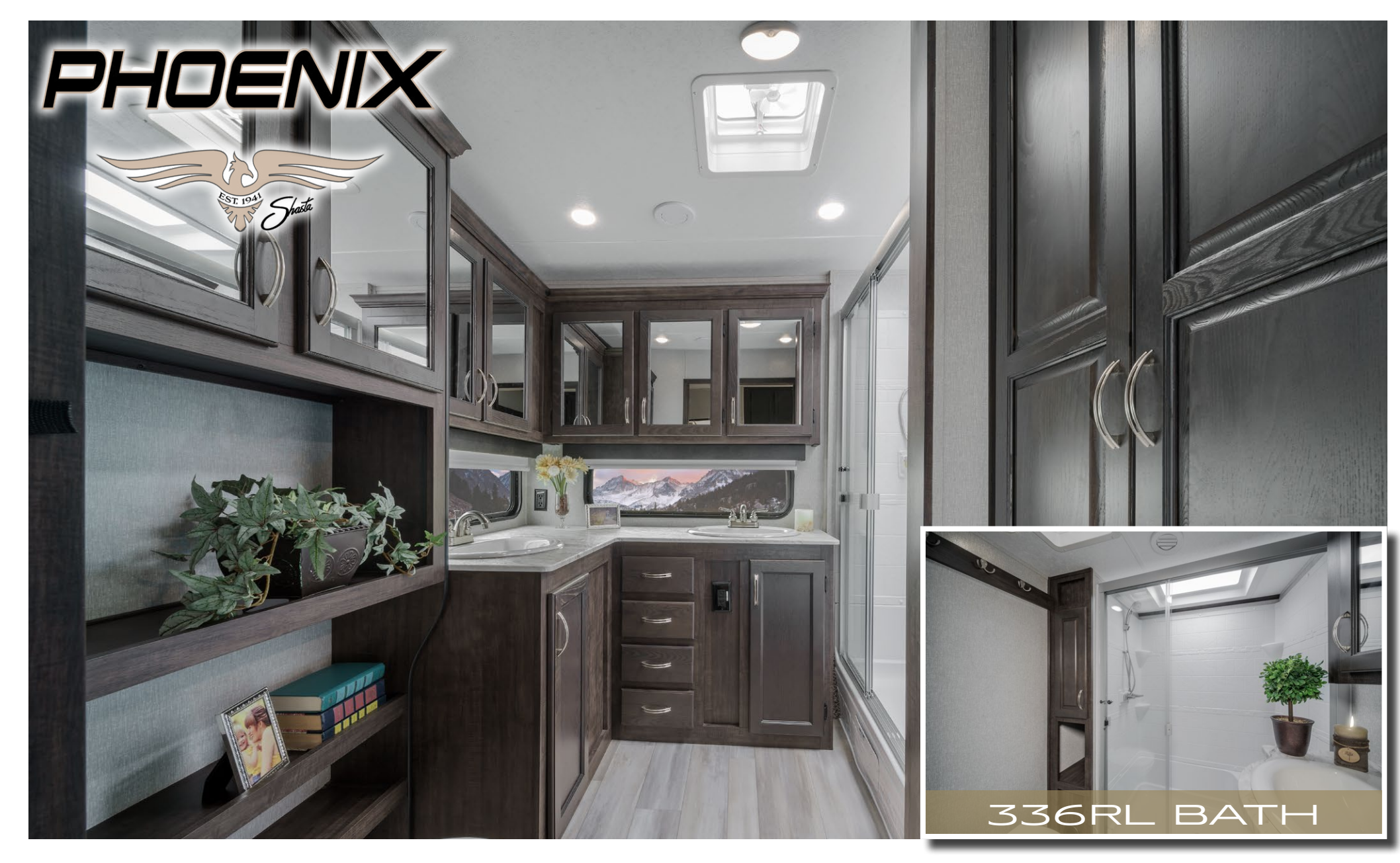
Dual Lav Master Bath w/ XL Stackable Washer/Dryer Closet - 334FL