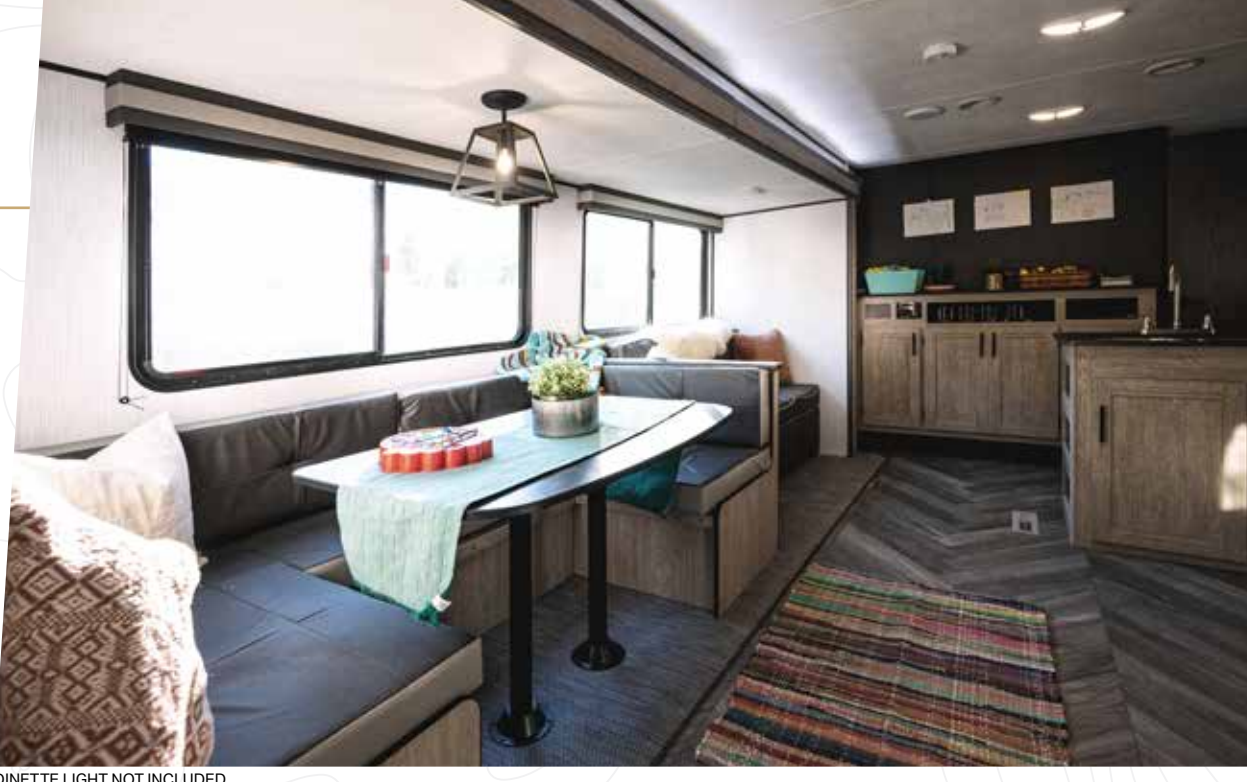
DINETTE LIGHT NOT INCLUDED