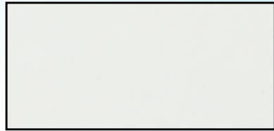
WHITE (US ONLY)