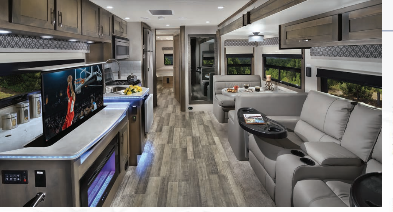
Force 37TS with Driftwood cabinetry and Carbon décor, is shown with these options: power theater seats, entertainment center with 50" LED TV and fireplace.