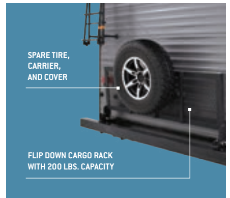
SPARE TIRE, CARRIER, AND COVER