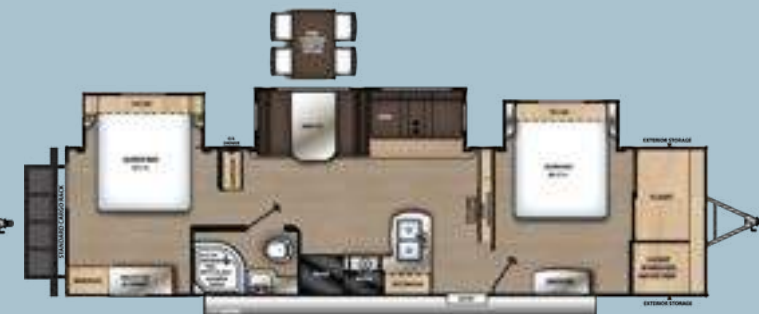
343BHTS (2 QUEEN)