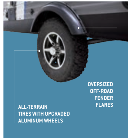
ALL-TERRAIN TIRES WITH UPGRADED ALUMINUM WHEELS