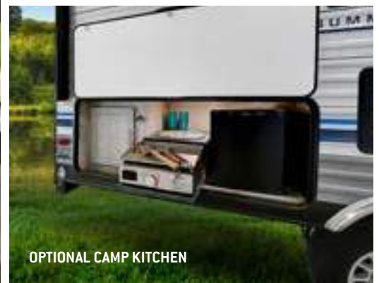
OPTIONAL CAMP KITCHEN