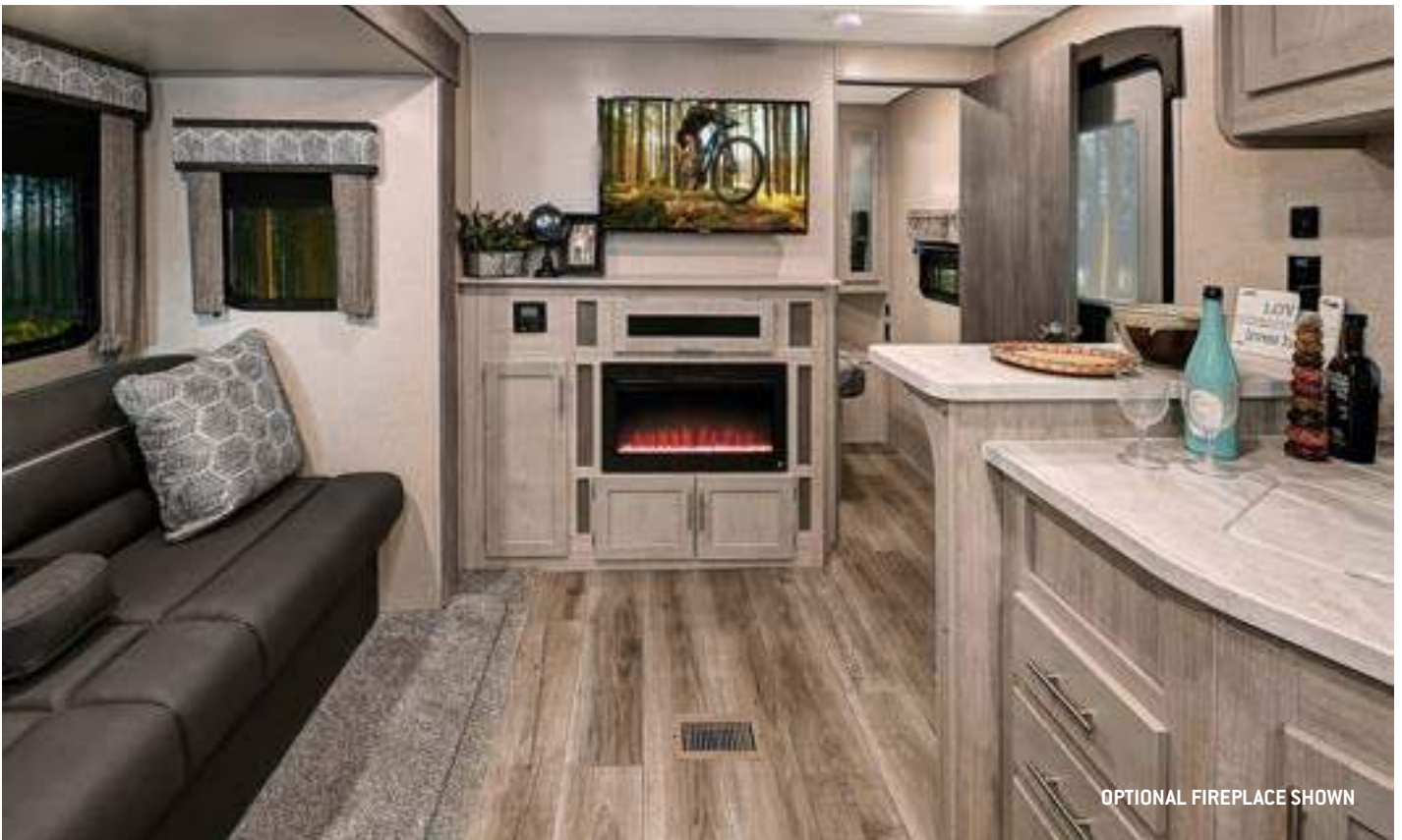
OPTIONAL FIREPLACE SHOWN

The popular 243RBS is the ideal couple's coach! This floor plan boasts a full size super slide with both a dinette and sofa, a spacious rear bathroom with a walk-in shower, extra-large pantry/wardrobe storage, a breakfast bar and private bedroom. The half-ton friendly towing weight and under 30' real length makes this camper perfect for cross country travel or local weekend getaways!