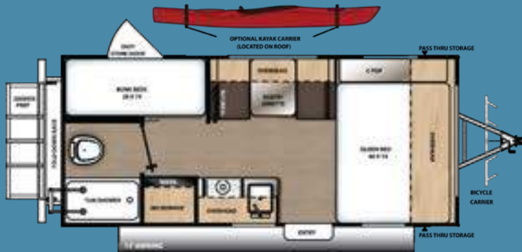
192BH TEMPORARILY UNAVAILABLE*