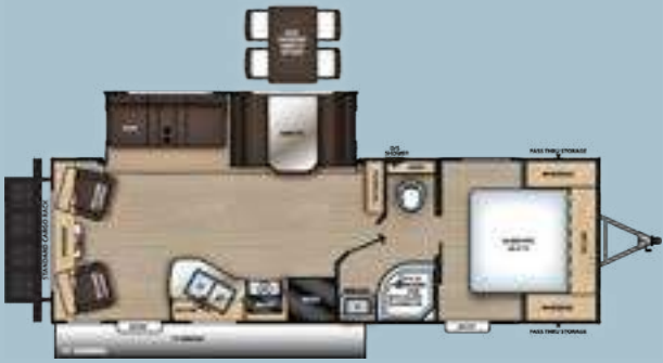
TEMPORARILY UNAVAILABLE* 263RLS

TEMPORARILY UNAVAILABLE* *Please check our website or contact your local dealership for changes to production availability.