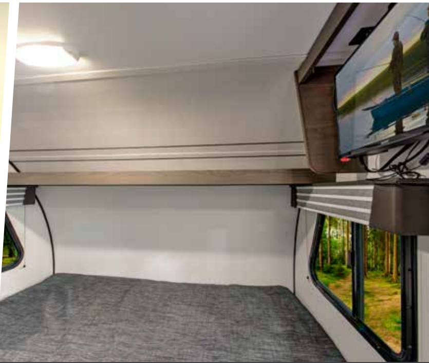
Bedroom comes standard with a 60"x80" queen sized bed, under the bed storage and with the TV placement within easy viewing.