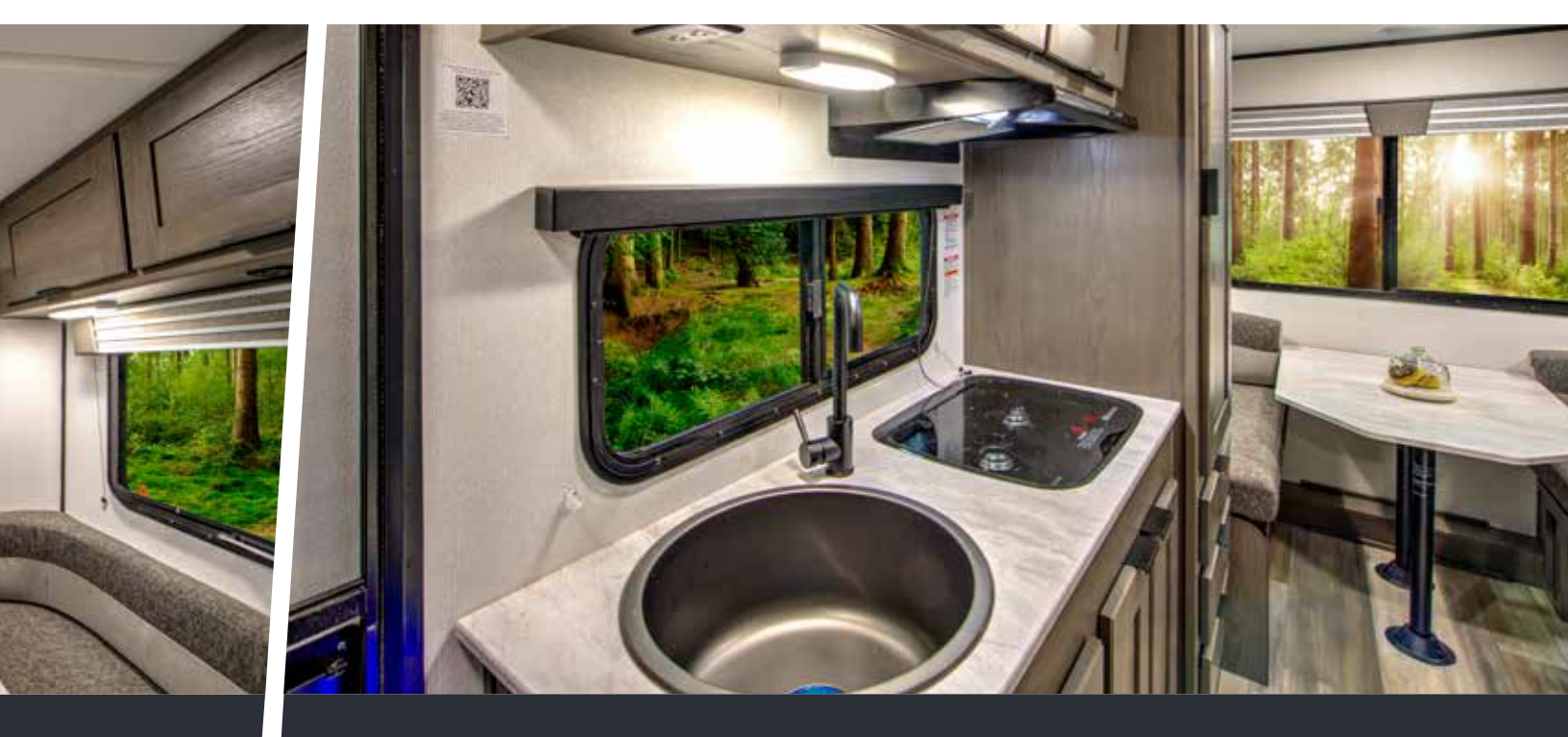
Beautifully designed European inspired cabinetry with recessed cooktop and residential style countertops.