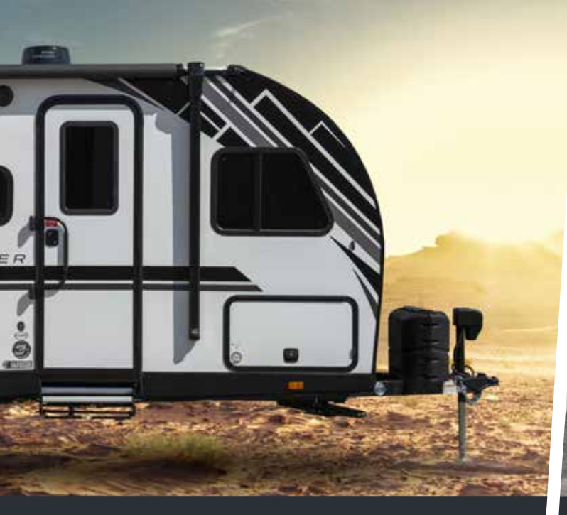
veigh less than wood. This process adds strength and durability ials.