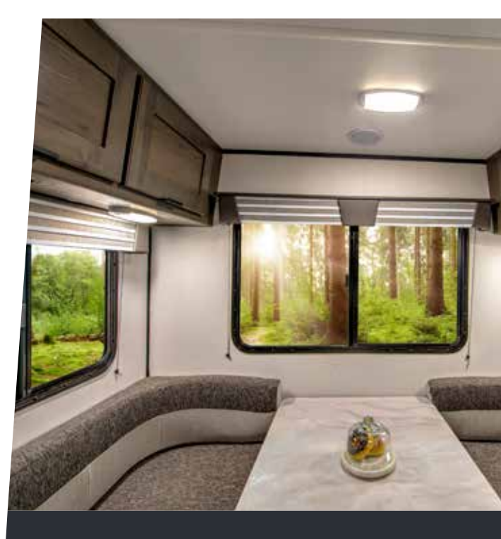
Spacious dinette seating with overhead cabinetry.