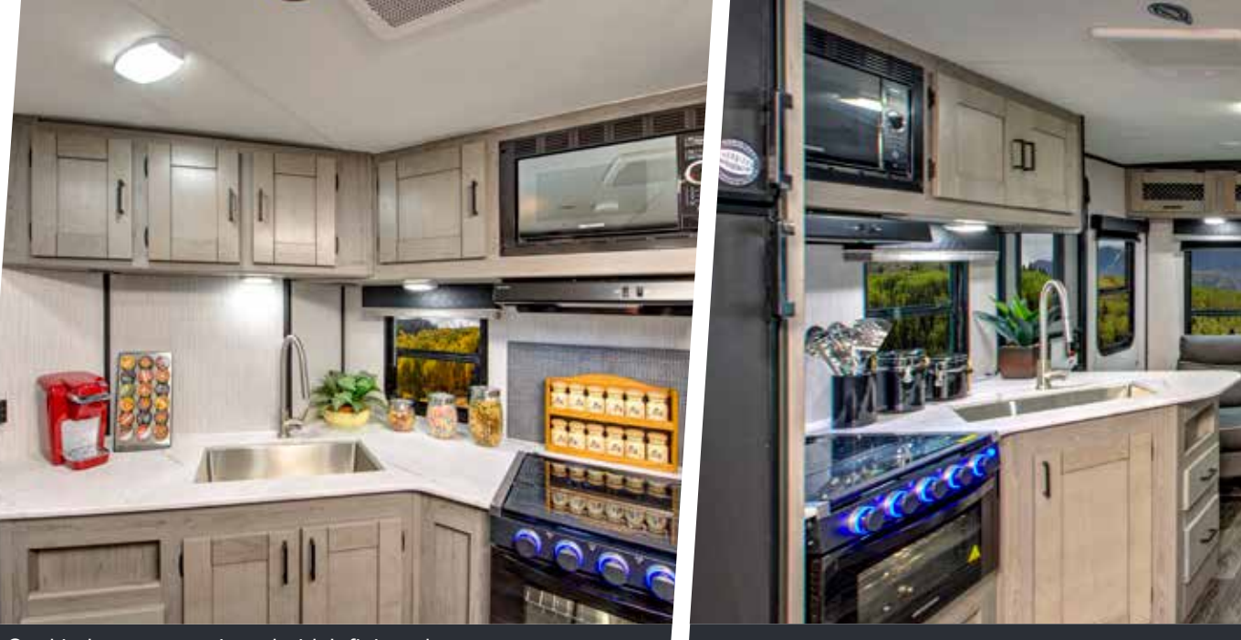
Fresh new interior with lighter floors and cabinets, designer accent walls, upgraded furniture and additional lighting features - all the features that make Mallard more than an RV, it's a home.