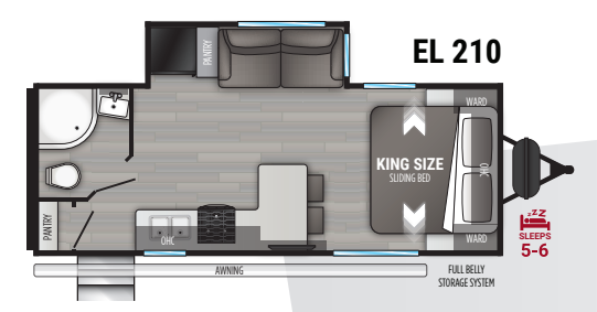
Length 25'11" Dry 5,360 lbs. Height 11'1" Hitch 680 lbs.