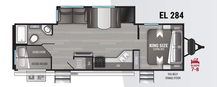
Length 32'11" Dry 6,684 lbs. Height 11'3" Hitch 864 lbs.