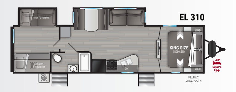
Length 36′ 5″ Dry 7,200 lbs. Height 11′ 5″ Hitch 940 lbs.