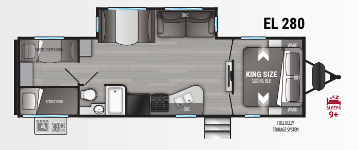
Length 33′ 4″ Dry 6,360 lbs. Height 11′ 3″ Hitch 820 lbs.