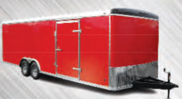
Phoenix - Car Haulers