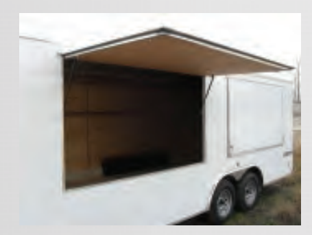
Concession Doors with Gas Props