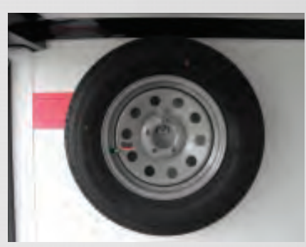
Interior Wall Mount Spare Tire Carrier