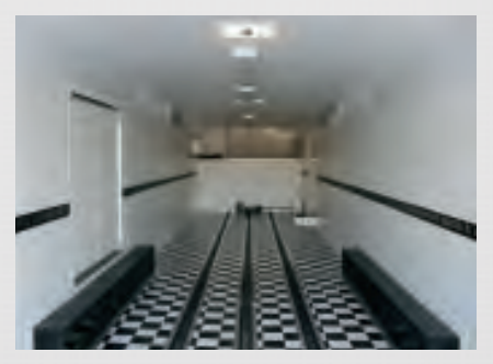
E-Track Floor and Walls