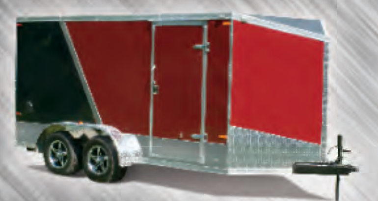
Daytona - Motorcycle Trailers