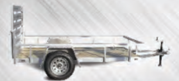
Open Utility Trailers