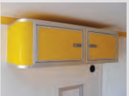
Radius Corner Helmet Cabinet