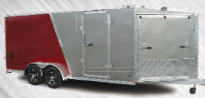
Comanche & Mountaineer - Snow Trailers