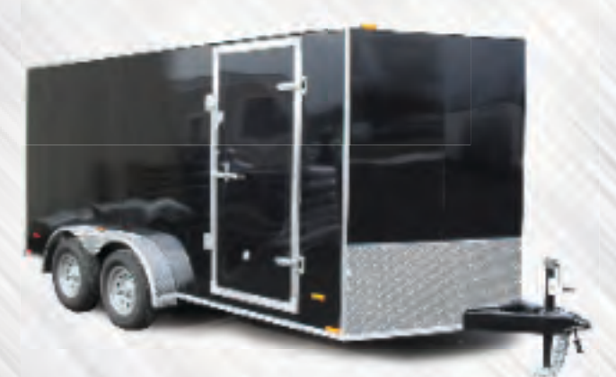
Yukon - Cargo Trailers