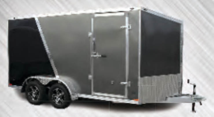
Aerostar - Aluminum Flat Top Slant Wedge