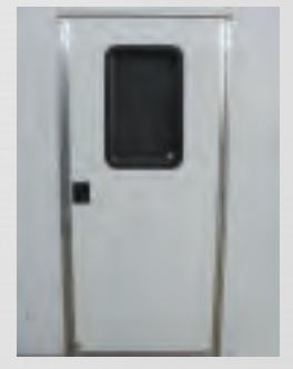
RV Side Door