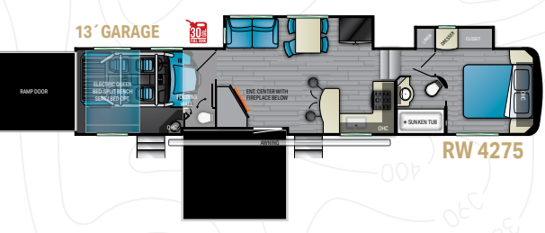
LENGTH: 45 '8" | HEIGHT: 13 '3" | HITCH: 3,525 LBS. DRY: 15,729 LBS. | GVWR: 20,000 LBS. | SLEEP CAPACITY: 5-6

LENGTH: 44<sup>6</sup>" | HEIGHT: 13<sup>3</sup>" | HITCH: 3,662 LBS. DRY: 16,240 LBS. | GVWR -20,000 LBS. | SLEEP CAPACITY: 5-6