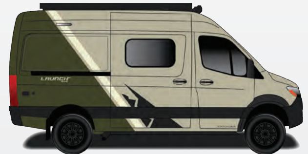
Forest Glade Partial Paint (sandstone van only)