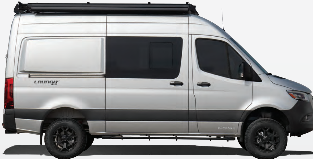
Standard Exterior (silver or sandstone)