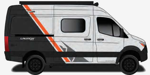
Aztec Partial Paint (silver van only)