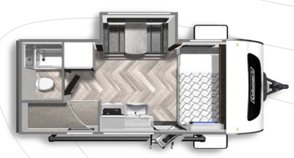
COLEMAN RUBICON 1708BH Length: 21' 5" Weight: 3,855 lbs. Sleeps: 4-6 Hitch: 482 lbs. Height: 10' 5"

*All information & specifications are for units manufactured after 04/15/2021