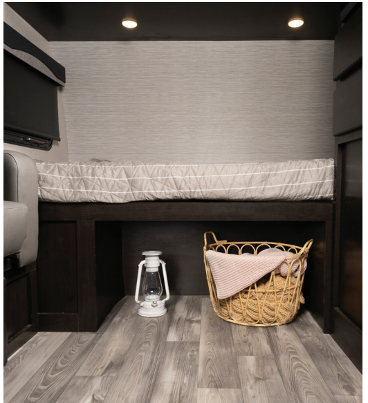
2022 Super Lite Maxx 16FBS