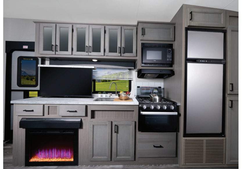
2022 Telluride 297BHS