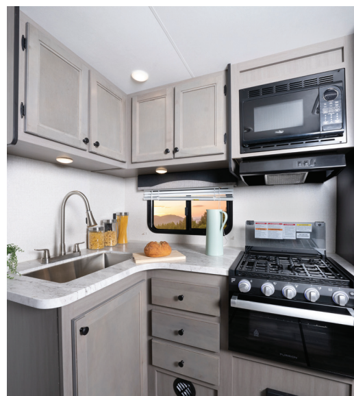
2022 Super Lite 241BH