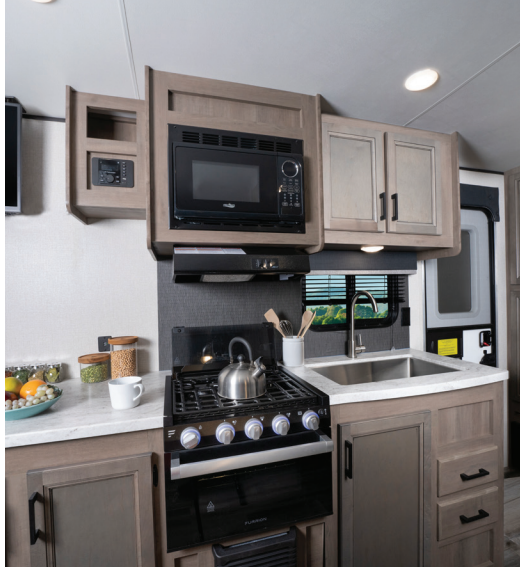
2022 Autumn Ridge 20FBS