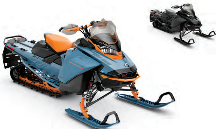
BACKCOUNTRY™ X® 146 850 E-TEC® SHOWN

A 50-50 sled with the most advanced technology, plus off-trail capability and rough-trail performance.