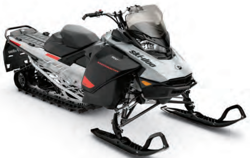
BACKCOUNTRY™ SPORT 146 600 EFI SHOWN

For the value-oriented 50-50 rider wanting an advanced platform and modern engine technology.