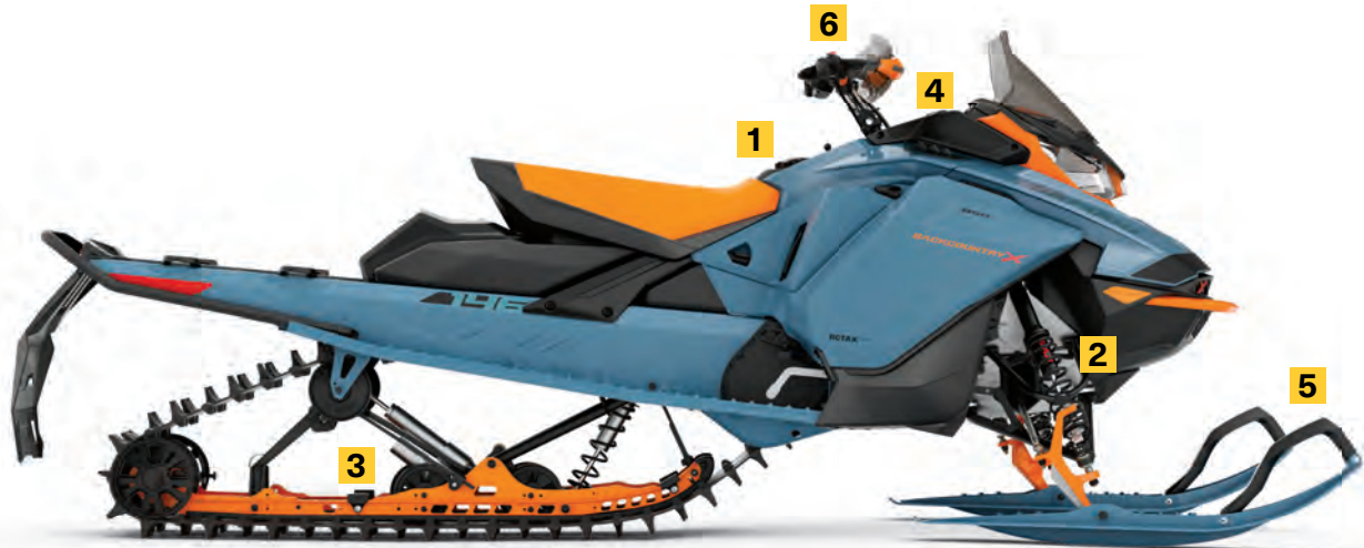
BACKCOUNTRY™ X® 146 850 E-TEC® SHOWN

Crossover-specific suspension uses best principles of the rMotion™ trail and tMotion™ mountain skids for confident cornering and agile boondocking.