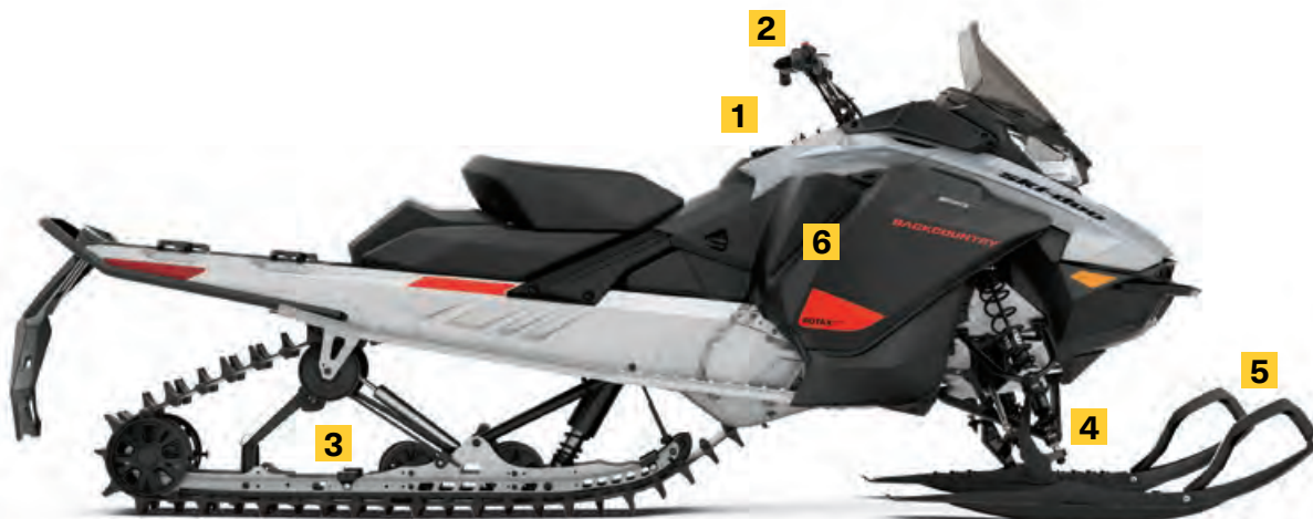
BACKCOUNTRY™ SPORT 146 600 EFI SHOWN

Saves time and energy, adding immense value for the rider.