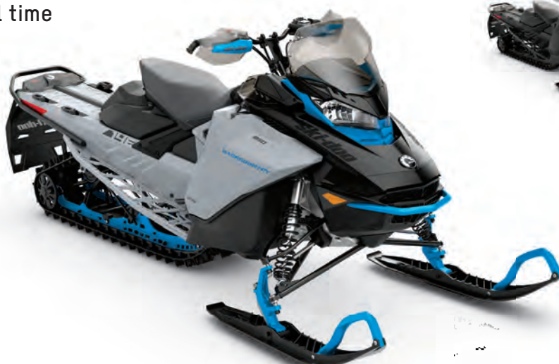
BACKCOUNTRY™ 146 850 E-TEC® SHOWN

Loaded with crossover-specific features for spending equal time riding on- or off-trail.