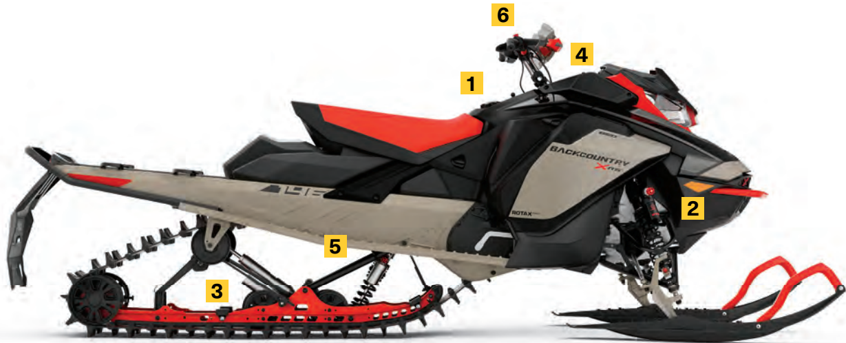
BACKCOUNTRY™ X-RS® 146 850 E-TEC® SHOWN

Crossover-specific suspension uses best principles of the rMotion™ trail and tMotion™ mountain skids for confident cornering and agile boondocking.