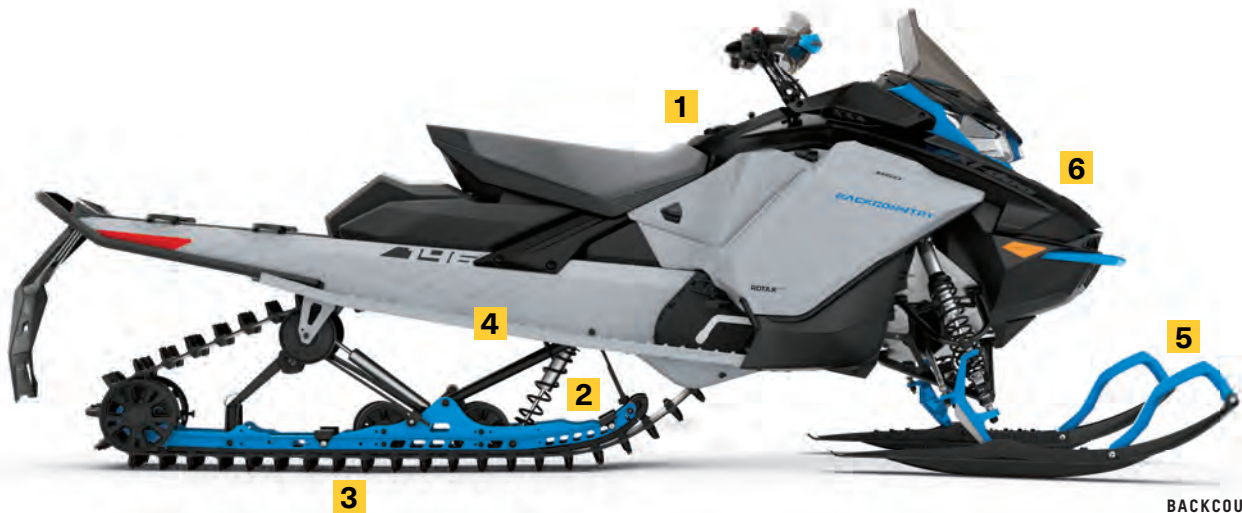
BACKCOUNTRY™ 146 850 E-TEC® SHOWN

Crossover-specific suspension uses best principles of the rMotion™ trail and tMotion™ mountain skids for confident cornering and agile boondocking.