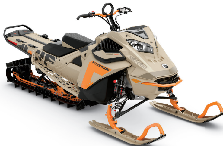
FREERIDE® 165 850 E-TEC® TURBO SHOWN