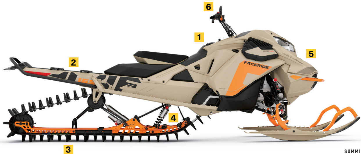
SUMMIT® SP® 165 850 E-TEC® SHOWN

A swiveling rear arm and split front arm allow the skid to flex laterally for more predictable carving. More rising-rate motion ratio adds capacity and comfort. Reinforcement ensures strength on hard landings.