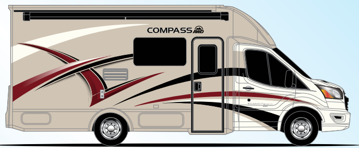
ARCADE FIRE THO-MAX