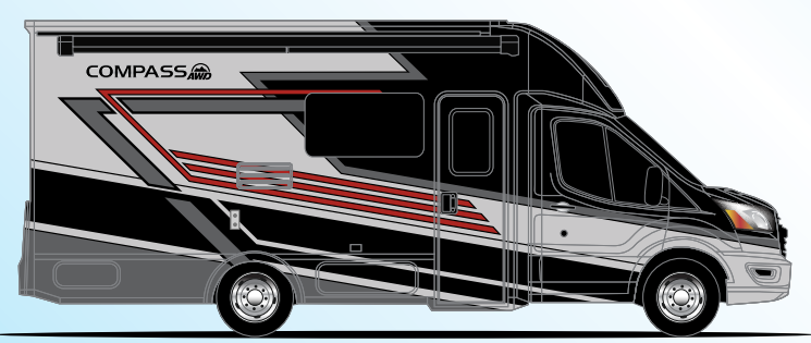
FIBRE OPTIC FULL-BODY PAINT