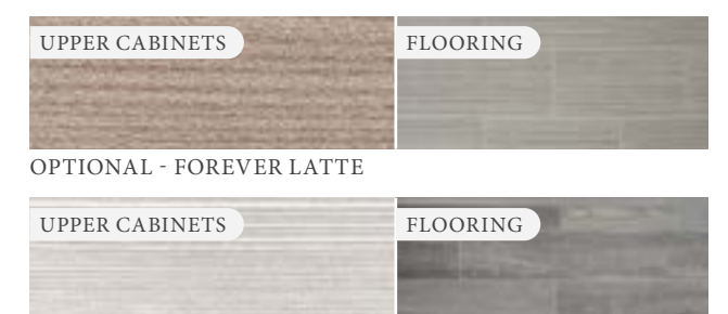
OPTIONAL - UPTOWN GRAY