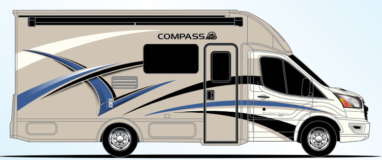
STELLAR BLUE MHD-MAX