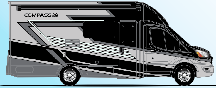
TRUE NORTH FULL-BODY PAINT