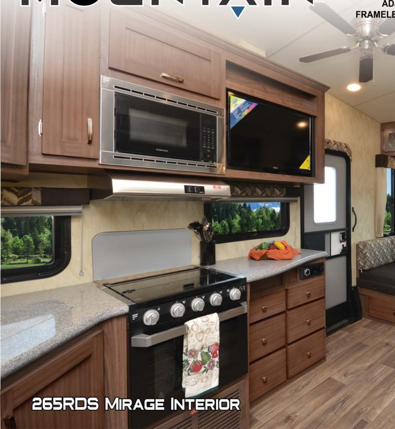
265RDS MIRAGE INTERIOR

NORTHWOOD BUILT, INDEPENDENTLY CERTIFIED, OFF-ROAD CHASSIS GENERATOR READY * CATHEDRAL ARCHED CEILING CONSTRUCTION LED EXTERIOR & INTERIOR LIGHTING * STAINLESS STEEL APPLIANCES FULLY WELDED, THICK-WALL ALUMINUM FRAME CONSTRUCTION SOLID SURFACE COUNTERTOPS * INTERIOR COMMAND CENTER ADJUSTABLE PITCH CAREFREE TRAVEL'R 12V LED AWNING FRAMELESS WINDOWS * 10 CU FT FRIDGE W/ COLD WEATHER KIT MORryde STEP ABOVE ENTRY STEP WITH STRUT ASSIST POWERED DUAL-MOTOR SLIDING STAB JACKS, REAR HIGH DENSITY BLOCK FOAM INSULATION EXTERIOR CONVENIENCE CENTER 12-VOLT POWER LANDING GEAR