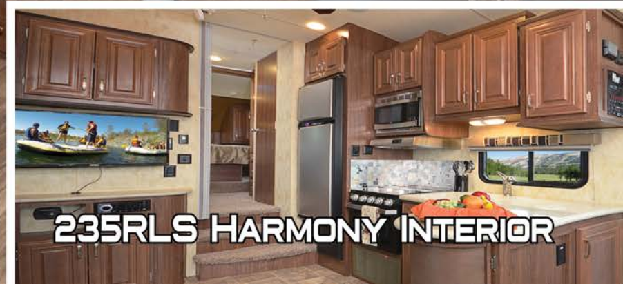
235RLS HARMONY INTERIOR