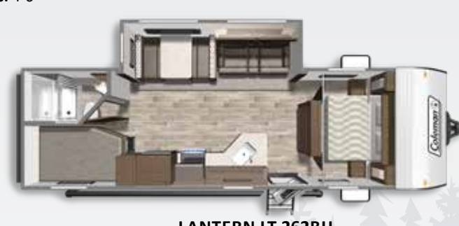
LANTERN LT 262BH Length: 30' 7" Weight: 5,894 lbs. Sleeps: 4-8 Hitch: 752 lbs. Height: 11'4"