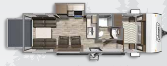
LANTERN TOY HAULER 270TQ Length: 31' 6" Weight: 6,176 lbs. Sleeps: 4-8 Hitch: 935 lbs. Height: 11' 4"