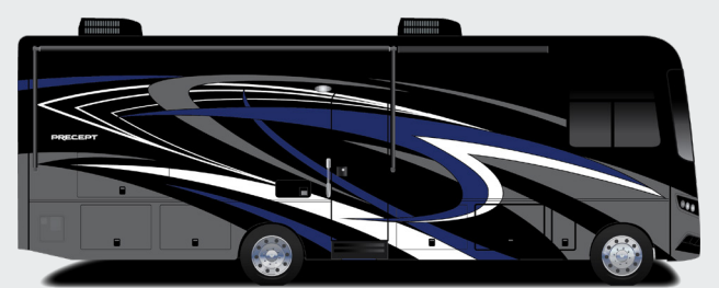
Alpine Full-Body Paint