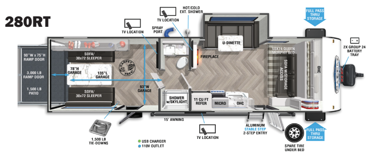
Length: 32' 4" • UVW: 5,608 lb.