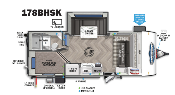
Length: 22' 11" • UVW: 3,749 lb.