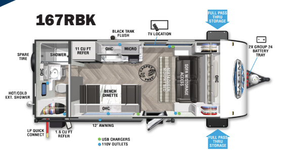
Length: 21' 2" • UVW: 3,084 lb.