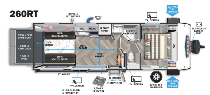
Length: 28' 8" • UVW: 4,728 lb.