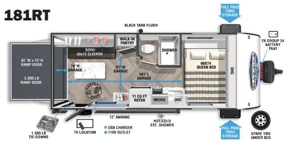
Length: 21' 8" • UVW: 3,204 lb.