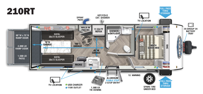
Length: 28' 8" • UVW: 4,997 lb.