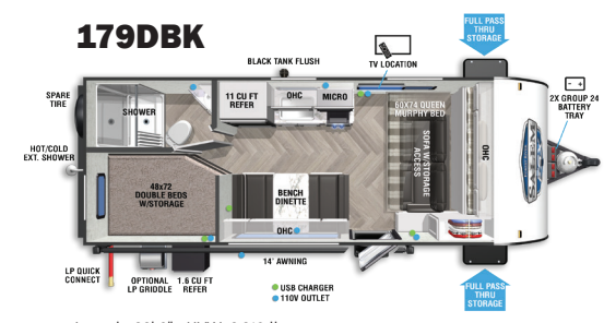
Length: 22' 6" • UVW: 3,219 lb..