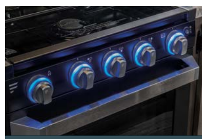
COOKTOP offers recessed, three-burner work area with a glass cover, and LED accented oven knobs.