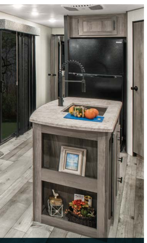
363FL Gunmetal décor