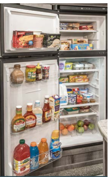
Standard 8 CU FT gas/ electric, or choose the optional 10 CU FT 12V REFRIGERATOR (shown). Both offer room for all your camping goodies. Destination trailers receive 18 CU FT residential refrigerator.