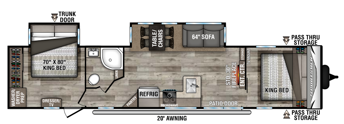
3\,6\,2\,D\,B \, UVW - 8,330 \,|\, Exterior Length - 40' 9" \,|\, Sleeps 6 \,