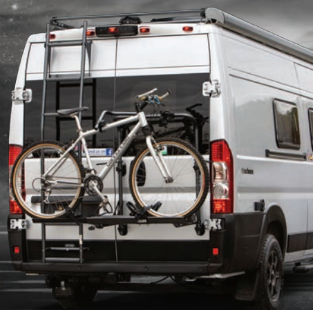
Optional bike rack