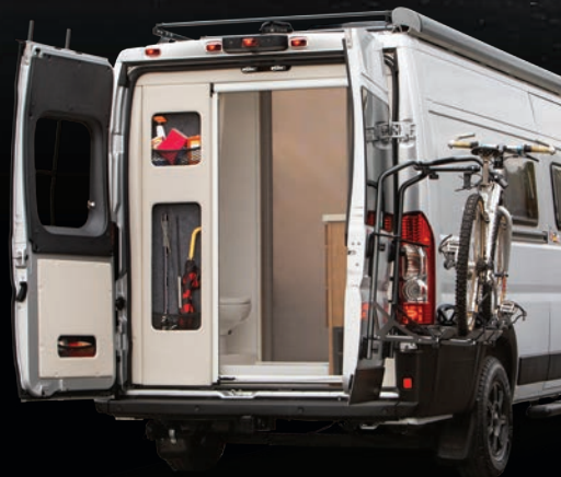
Easy to access rear bath and storage