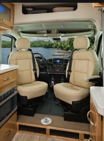
Swivel Captains chairs with removable table