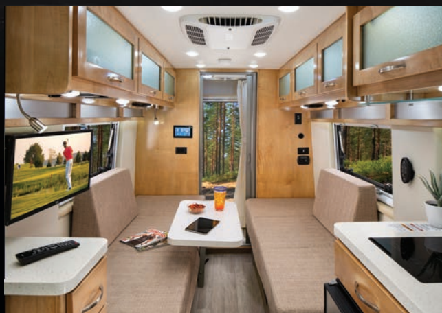
The versatile 20RB twin bed model has contemporary hardwood cabinetry and a spacious rear bath with a one-piece fiberglass shower. Nova's side windows open to increase ventilation.