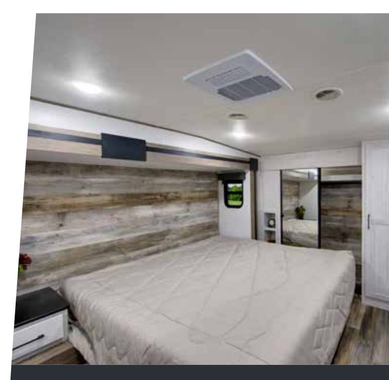
Every bedroom is beautifully designed and comes equipped with a storage, washer/dryer prepped and ducted A/C in the bedroom.