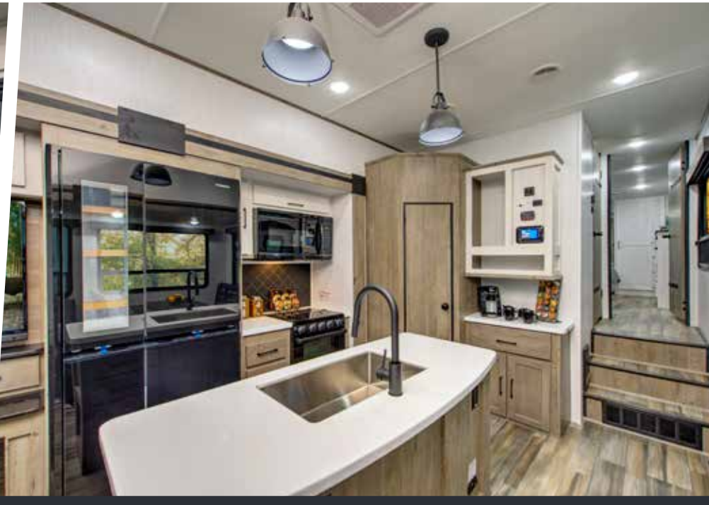
Our kitchens is a chef's dream. Most models come standard with 30^{\prime\prime} microwave and 21^{\prime\prime} oven, solid surface counter tops, true dinette table, and a 14 ft.3 residential refrigerator.