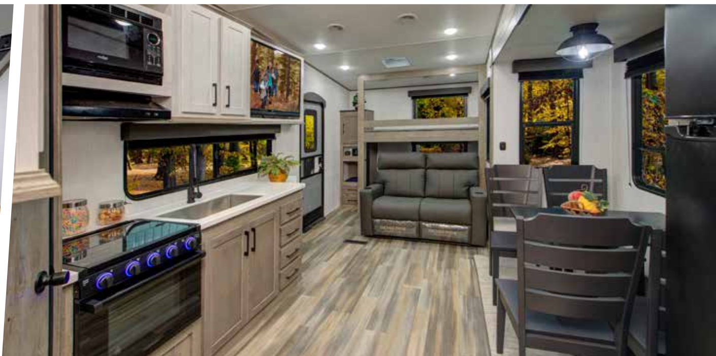
Entertainment living space for friends and family. Most units feature 40" luxury fireplace, 50" entertainment TV with sound bar, no carpet in the slideout, and wireless charging ports.