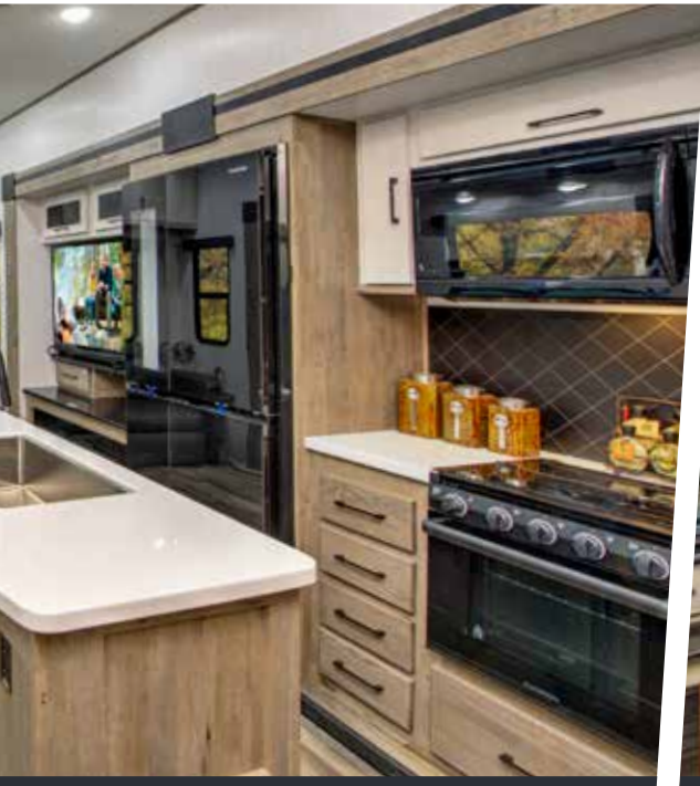
2 toned cabinetry, and farmhouse details. What site and aluminum sidewalls, which creates a ure that will increase the life of your RV.