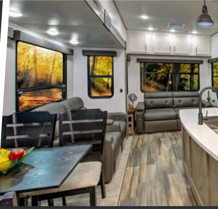
Beautifully designed new interior featuring lightened interiors with you don't see is our Milestone/M1 series is built with Azdel Compostrong, lightweight quiet, weather and temperature resistant struct