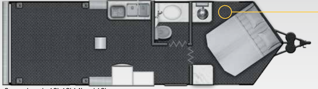
Garage length: 10', 12' 14' and 16'