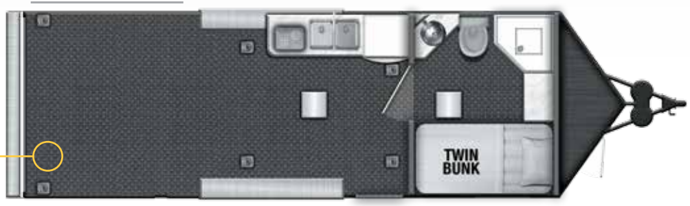
Garage length: 10' 8", 12' 8", 14' 8" and 16' 8"