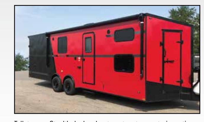
Talk to your Stealth dealer about our two-tone exterior option.

Stealth just built a better Toy Hauler for you. We know you need more than one day to have your fun so you need a unit that's able to go the distance. That's Nomad. We have packed it with features you need like a spacious garage, modest living quarters and ample storage. Hunting or camping, motorcycles or ATV's, Corvettes or Jeeps, Nomad has you covered.