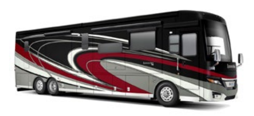
PAXTON EXTERIOR Awning Color: Charcoal Tweed