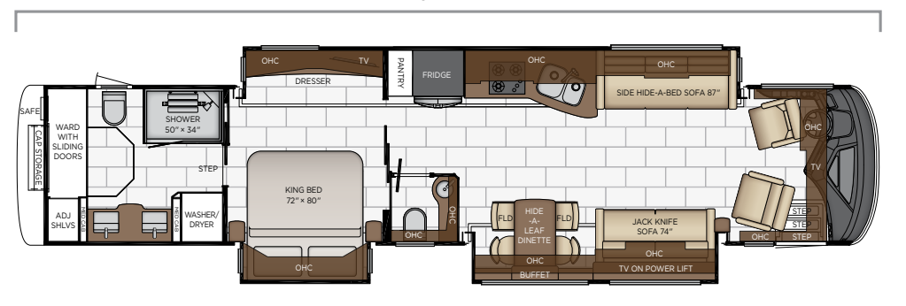
Length: 44' 10"