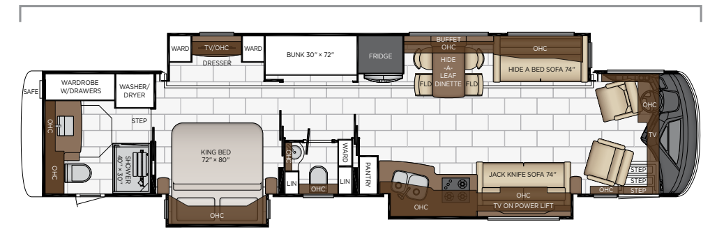
Length: 44' 10"