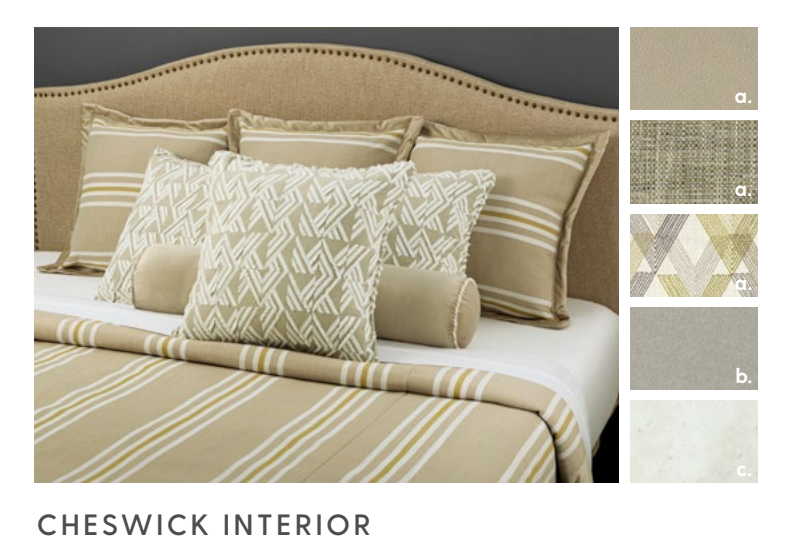
a. Furniture/Fabric b. Flooring c. Counter Top