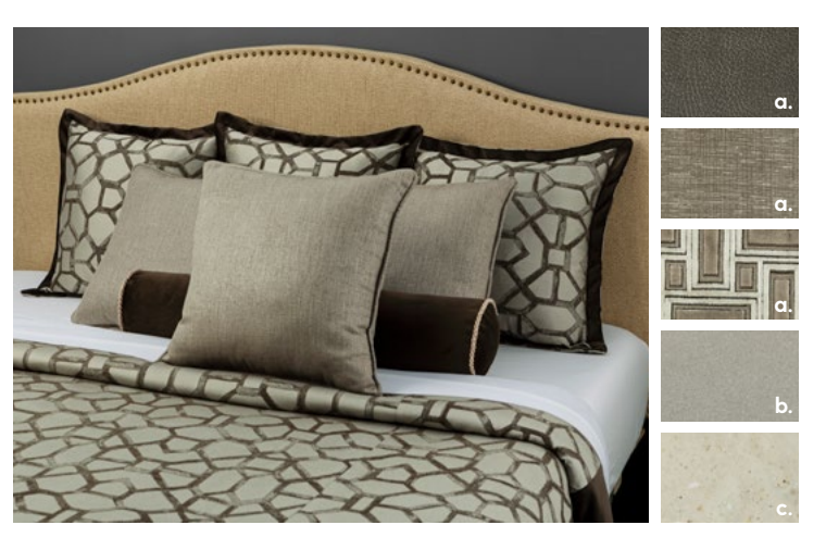
SIROCCO INTERIOR a. Furniture/Fabric b. Flooring c. Counter Top