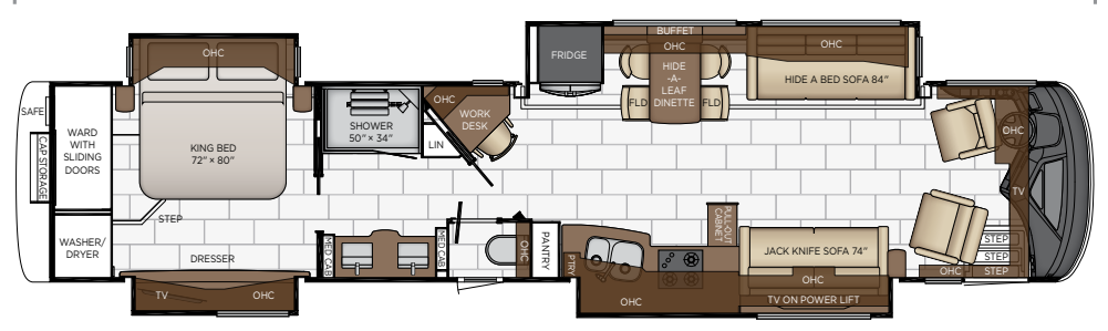
Length: 44' 10"