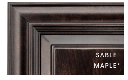
*Available in High Gloss or Matt Finish