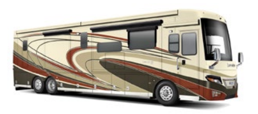
SIROCCO EXTERIOR Awning Color: Linen Tweed