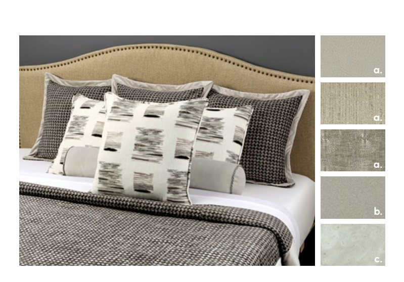
PAXTON INTERIOR a. Furniture/Fabric b. Flooring c. Counter Top