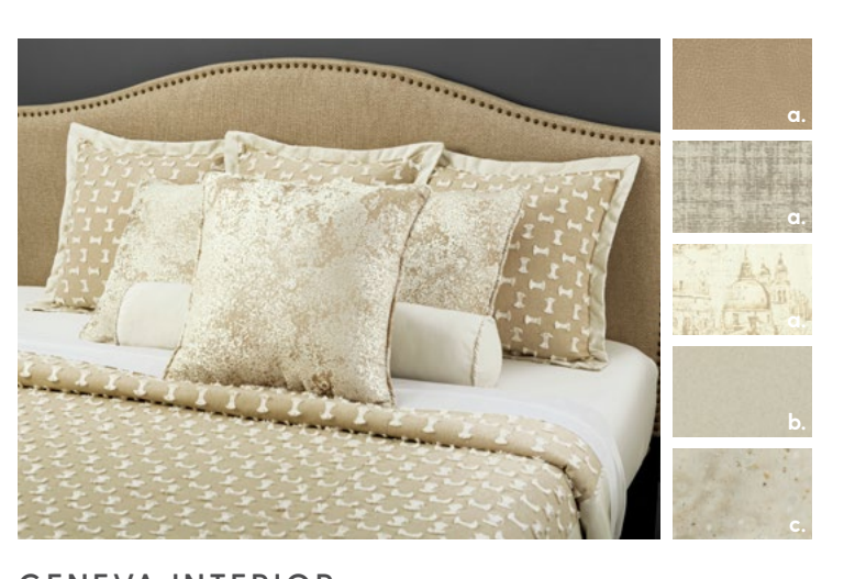
GENEVA INTERIOR a. Furniture/Fabric b. Flooring c. Counter Top