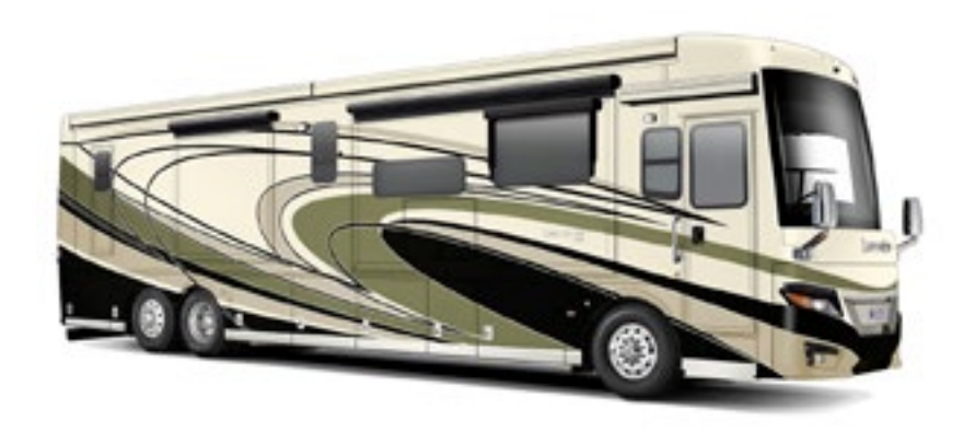
CHESWICK EXTERIOR Awning Color: Charcoal Tweed