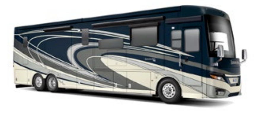
GENEVA EXTERIOR Awning Color: Charcoal Tweed