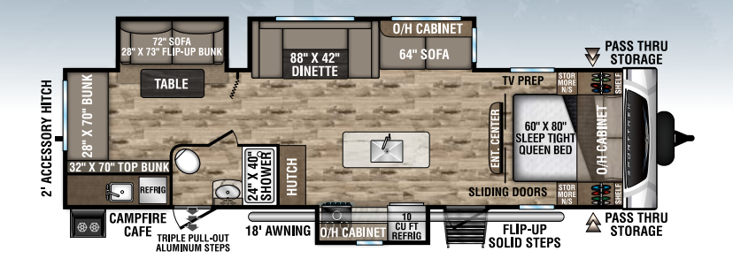
ST320VIK | 7,940 UVW | 35' 11" LENGTH | SLEEPS 11