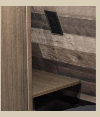
StorMore nightstands on each side of queen bed, behind fulllength closets.