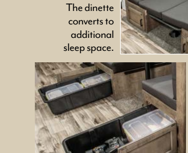
Dinette seats feature large removable storage bins secured by heavy-duty cabinet latches.