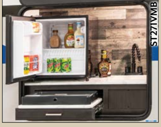
This Campfire Cafés features a refrigerator, 2-burner cooktop, and sink with hot and cold water and hose attachment. (241VMS, 251VRK, 271VMB, 291VRK, 312VIK)