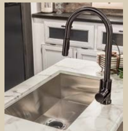
Sink cover drains food and dishes, and rolls out of the way for sink use.