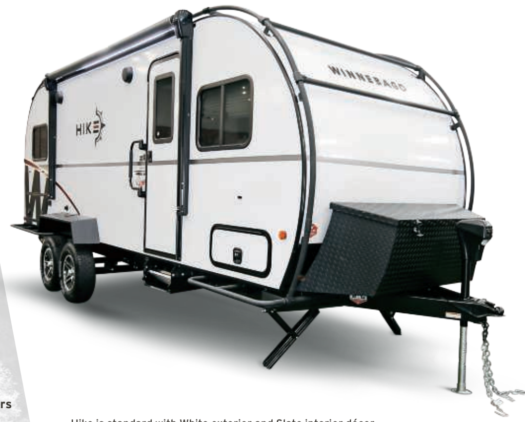
Hike is standard with White exterior and Slate interior décor