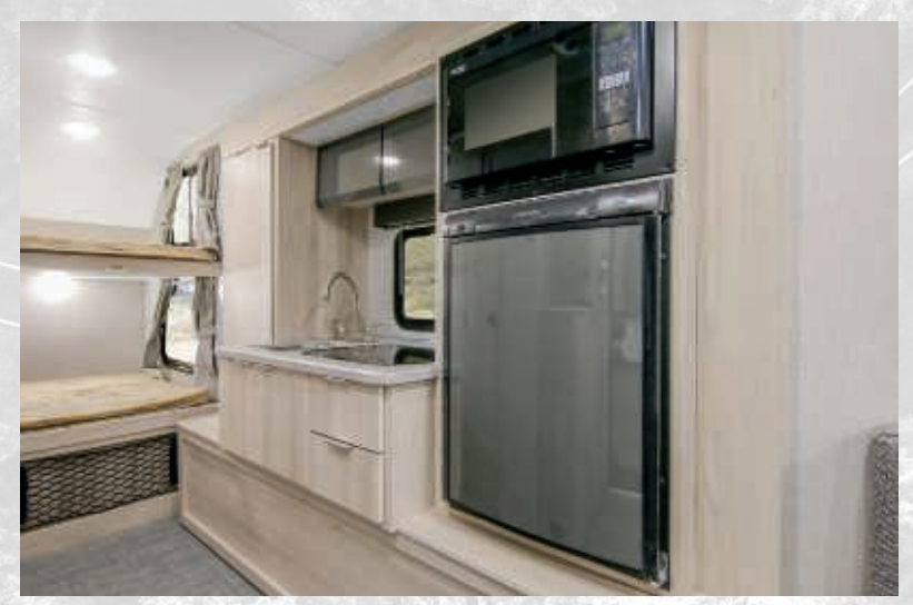
Recessed cooktops, convection microwaves & gas/electric refrigerators are standard and complimented with Crank Style accent cabinets