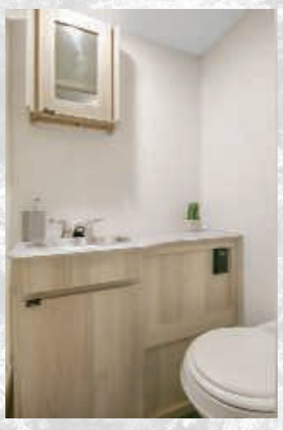
All Hike models are dry baths, giving you maximum functionality in a compact trailer.