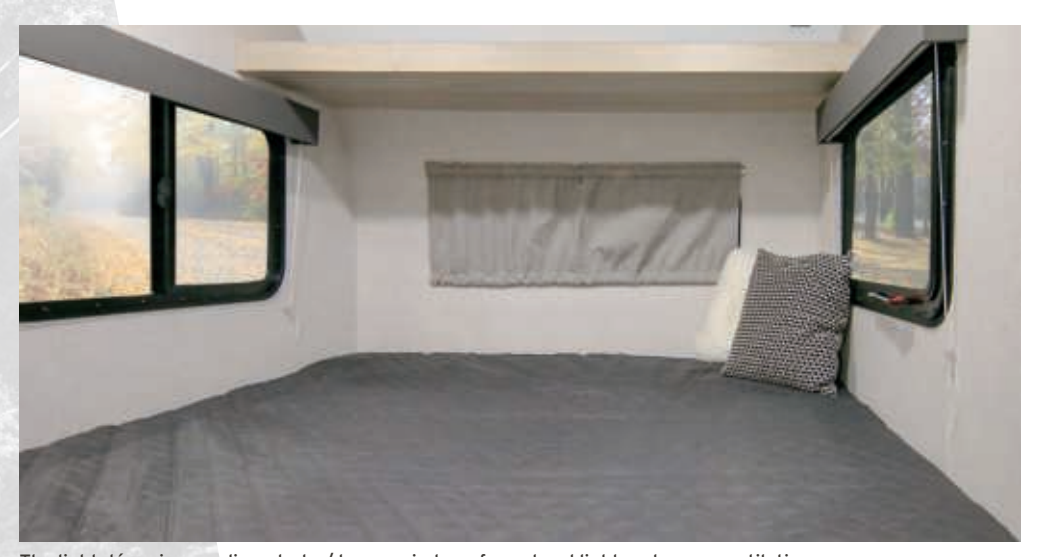
The light décor is complimented w/ larger windows for natural light and cross ventilation