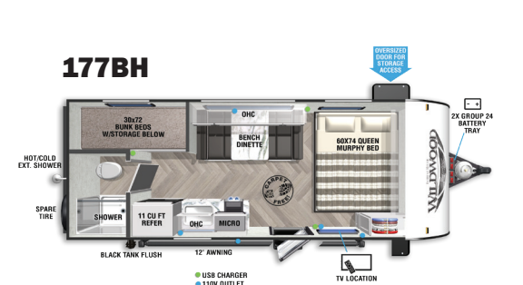
Length: 22' 0" • UVW: 3,074 lb.