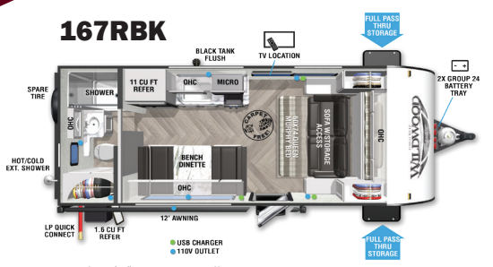
Length: 21' 2" • UVW: 3,084 lb.