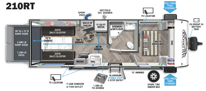
Length: 28' 8" • UVW: 4,997 lb.