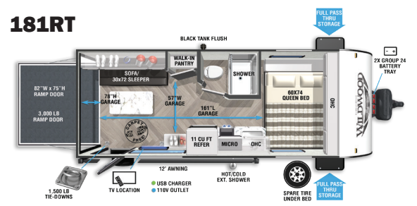
Length: 21' 8" • UVW: 3,204 lb.