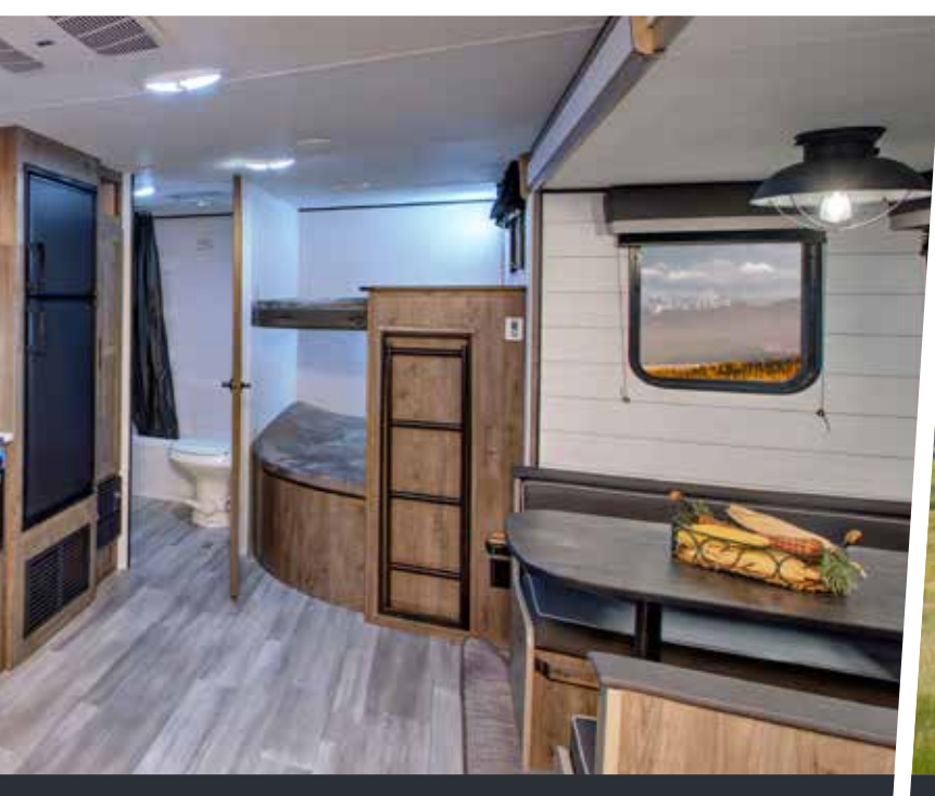
ee slideouts. The extra large windows provide a lot of extra light and can