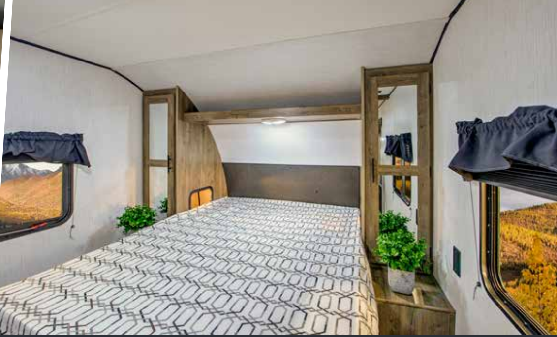
Pioneer master suite features a 60^\circ x \, 80^\circ residential queen bed, full length dual wardrobes with integrated lighting and USB charging and CPAP ready storage with full power access.