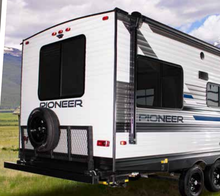
Our flip-down storage rack is perfect for the famliy to store bikes, wood, coolers and more. Also, our Pioneers come standard with large pass through storage featuring 52 cubic feet of space.