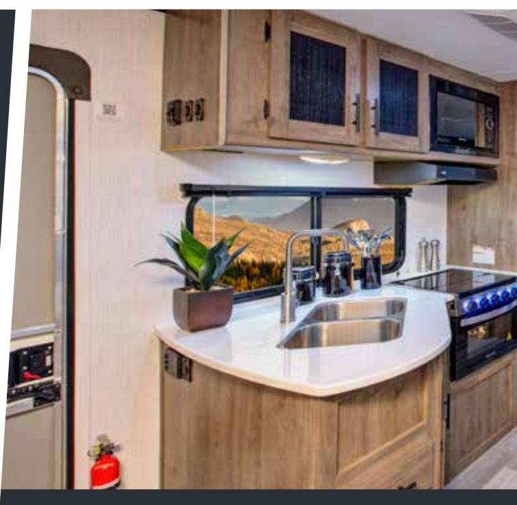
The all new Pioneer features a fresh modern interior decor and carpet fropen to create a comfortable living space.