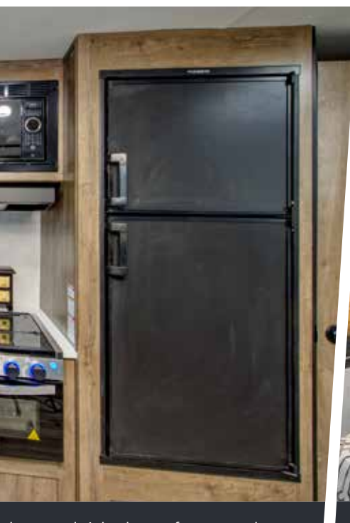
nless steel sink, plenty of storage, glass