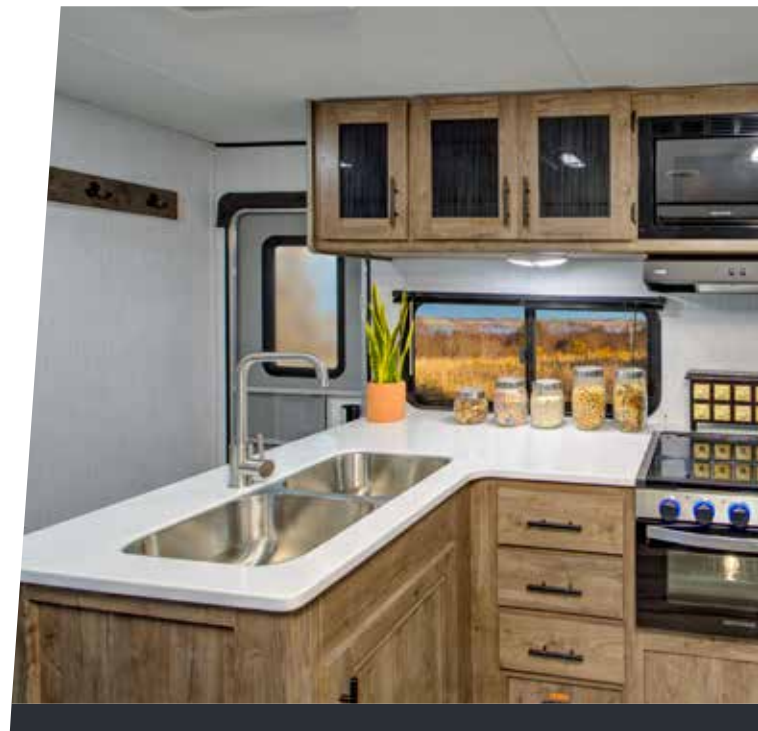
This ultimate kitchen comes with solid surface counter tops, large stai cabinet inserts and 8 cubic foot refrigerator with a chalk board front.