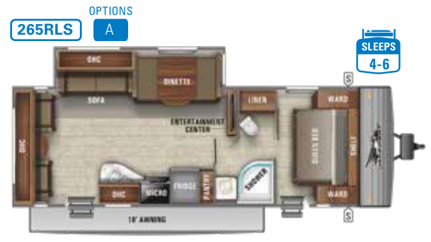
Ext. Lgth: 31' 1" Weight: 6,110 lbs. Hitch: 710 lbs.