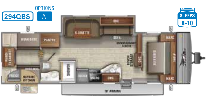
Ext. Lgth: 35' 7" Weight: 6,715 lbs. Hitch: 830 lbs.