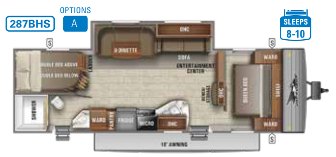
Ext. Lgth: 33' 7" Weight: 6,210 lbs. Hitch: 705 lbs.