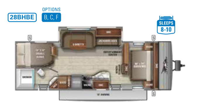
Ext. Lgth: 33' 7" Weight: 6,640 lbs. Hitch: 680 lbs.