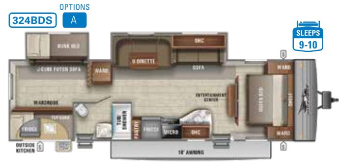
Ext. Lgth: 36' 4" Weight: 7,760 lbs. Hitch: 970 lbs.

Scan QR code for specification definitions