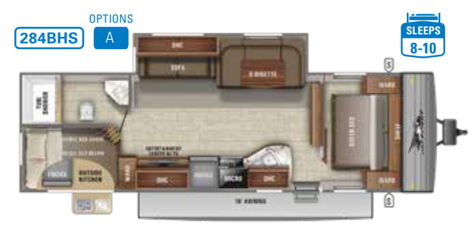
Ext. Lgth: 33' 7" Weight: 6,275 lbs. Hitch: 750 lbs.