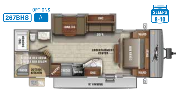
Ext. Lgth: 30' 4" Weight: 5,840 lbs. Hitch: 695 lbs.